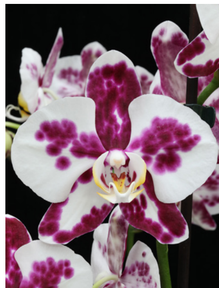
Phalaenopsis Marrakesh.

Unusual hooded flowers bloom successively, providing a long flowering period. Mature plants may flower for most of the year. When small can be grown on a windowsill in indirect sunlight.