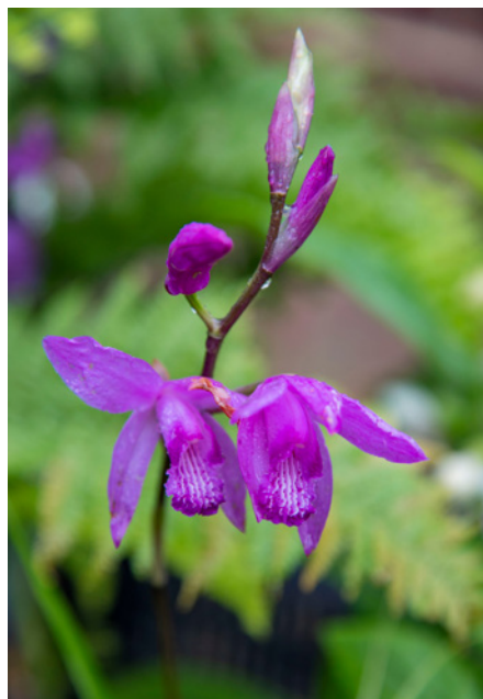
Bletilla striata.

Late-flowering, to 50cm tall; sepals and petals white, contrasting with white rounded pouch heavily dotted and suffused with magenta. Quite easy to grow. Forms large clumps.