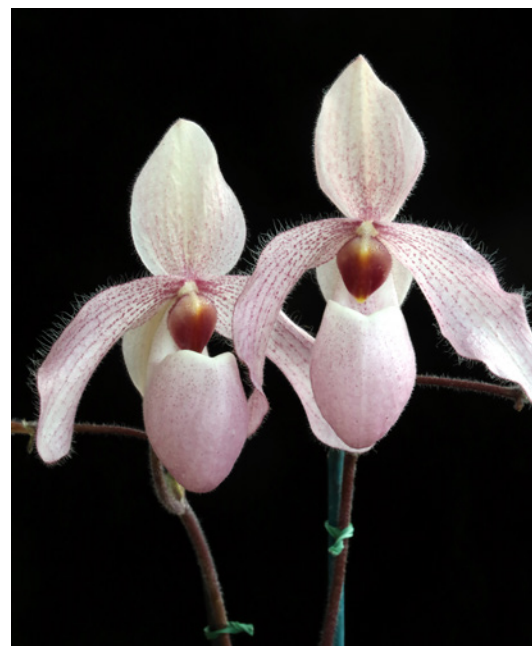
Paphiopedilum Delophyllum gx.

Made and registered by Sanders in 1927, this has stood the test of time. Classic Paphiopedilum in apple-green and white with stiff upright stem. Popular with flower arrangers. Generally available as a young plant of single or two growths.