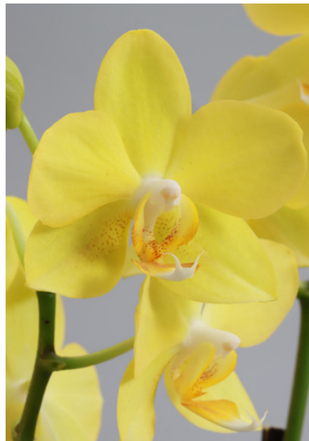
Phalaenopsis La Paz .

Flowers of good size, plain white with a yellow-edged lip, with up to six stems per plant.