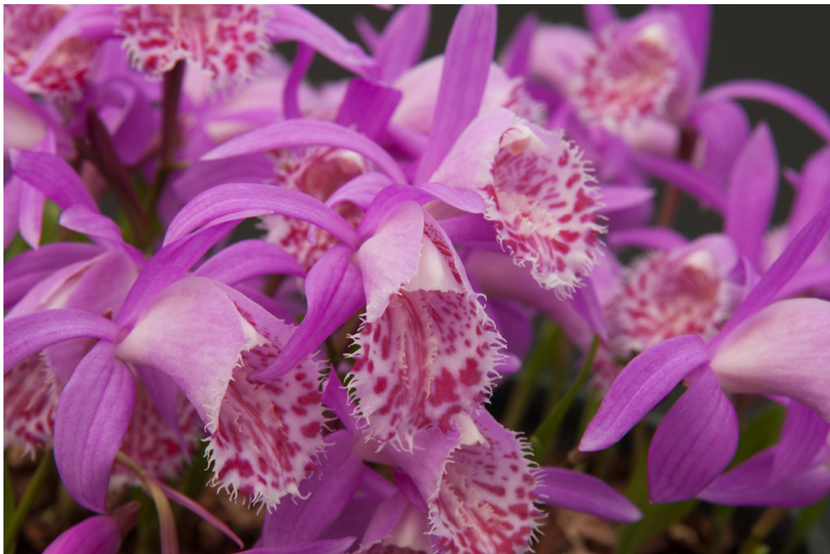
Pleione limprichtii .