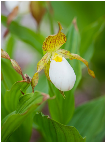
Cypripedium Ivory gx.