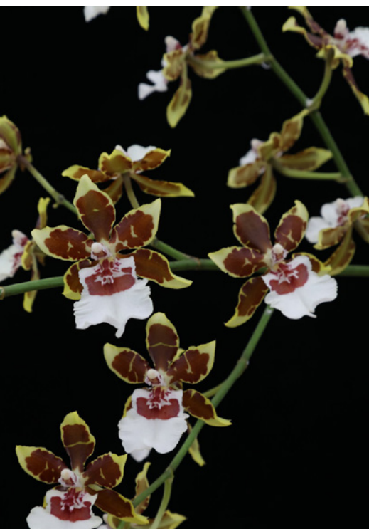
Oncidium Jungle Monarch gx.