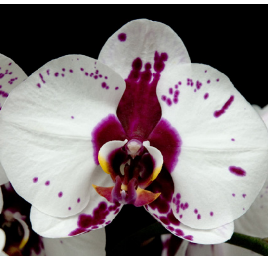
Phalaenopsis 'Picasso'.