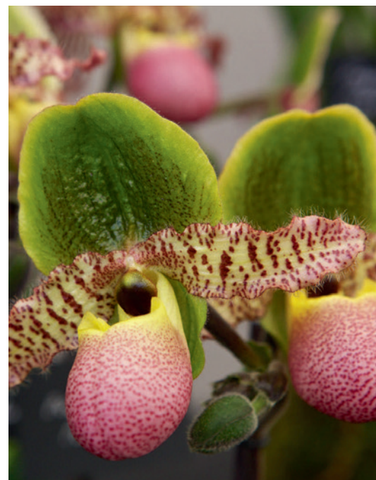
Paphiopedilum Pinocchio gx. Photo

Very floriferous, with attractive white flowers; an excellent example of a pendulous mini Cymbidium . The plant is best kept outdoors in semi-