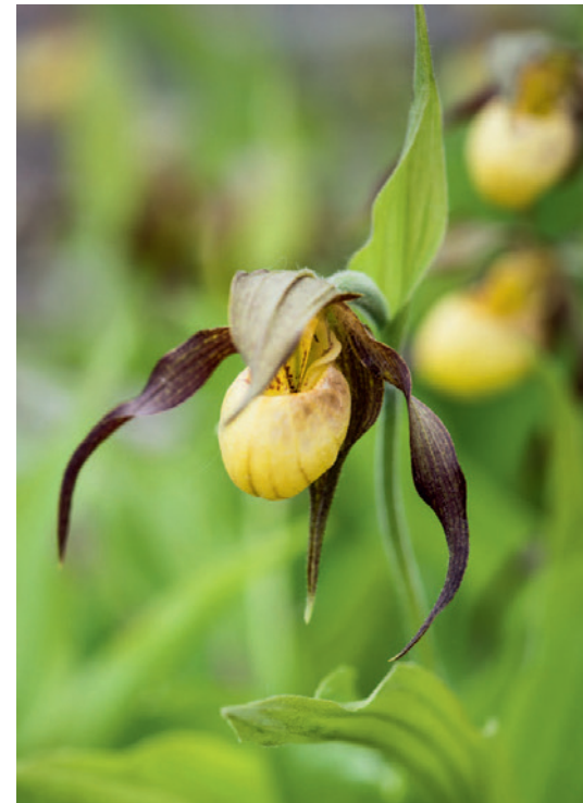
Cypripedium Hank Small gx.

To 35cm tall. Cream lip with pink coloration and strong red veins in the petals and upper sepals. Quite easy to grow.