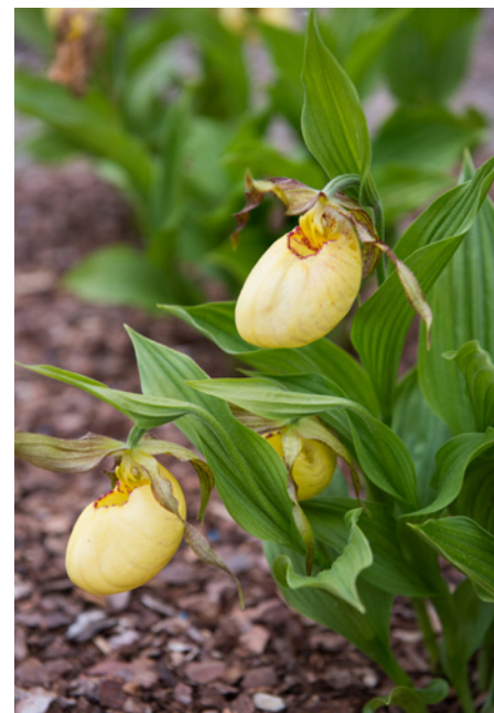
Cypripedium Victoria gx.

Hardy garden orchid; moisture-loving. Elegant spikes of small white flowers arranged in spirals. Scented vanilla and jasmine.