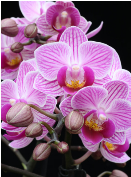
Phalaenopsis Birdie .