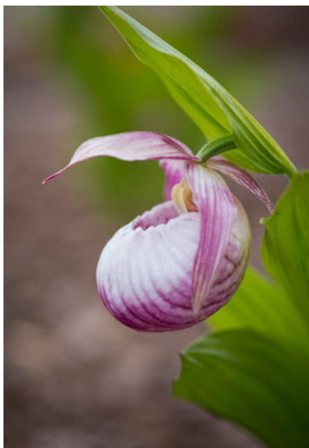
Cypripedium Sabine gx.