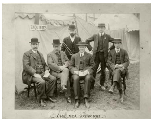
Above RHS staff at the Chelsea Flower Show, 1913

The Lindley Library is helping to celebrate the famous flower show's hundredth year at the Royal Hospital. Iconic images of the Chelsea Flower Show from the Library's archive will be on display around the showground and a special exhibition will be mounted in the Great Pavilion. The exhibition will aim to give an insight into the ways in which the Chelsea Flower Show has grown and changed in its 100 year history. Versions of the display will also go on show at RHS gardens from Tuesday 21 May - Friday 14 June. Visitors inspired to know more about the fascinating history of the show should look at Brent Elliott's new book 'RHS Chelsea Flower Show A Centenary Celebration'.