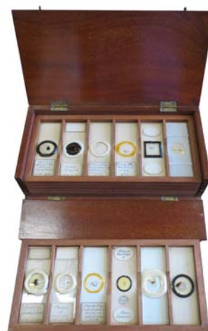
Above Box of microscope slides of insects and insect parts dating from the 1870s

In January the library appointed its first ever RHS archivist with sole responsibility for our extensive Archive Collections. Papers and objects produced, used or collected by the Society will be gradually catalogued to international standards, repackaged, and made accessible to researchers. The task is currently divided between the Lindley Libraries at Wisley and London. At Wisley the challenge is to catalogue items pertaining to the RHS scientists over the past 140 years. At Vincent Square the focus is on the collected archives of prominent horticulturalists.