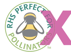
(vi) alter the opacity...