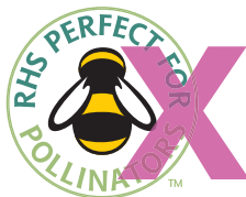
(vii) or tint...