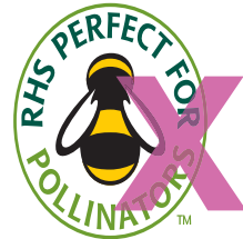
(iv) or vertically...