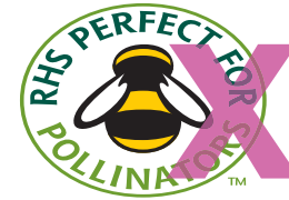
(iii) stretch horizontally...