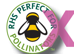
(viii) and add effects.