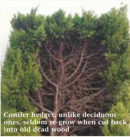
Conifer hedges, unlike deciduous ones, seldom re-grow when cut back into old dead wood