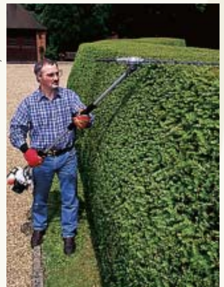
Good equipment greatly eases repeated trimming quality hedges need to stay looking good