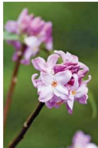
Daphne bhola 'Limpfield'

February is the best month to enjoy the delights of Daphne bhola , although they can flower for months. Outside Weather Hill Cottage and up on Battleston Hill we have some incredibly intoxicatingly scented specimens, including the cultivars 'Jacqueline Postill' and 'Limpfield'.