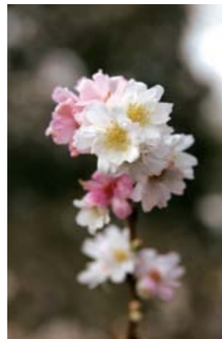
Prunus x subhirtella 'Autumnalis'

Between Seven Acres and the Pinetum delicate pink blossom twinkles on bare branches. The ornamental cherry Prunus x subhirtella gets its name from the Latin subhirtella meaning 'somewhat hairy'. Its cultivar name 'Autumnalis' refers to its time of flowering, although it generally flowers on and off between autumn and spring. The flowers are deep pink in bud, hence the common name of rosebud cherry.