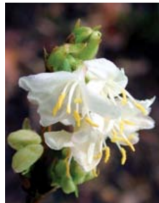
Lonicera x purpusii

Winter flowering plants are full of fragrance. Lonicera (shrubby honeysuckle) produces small white flowers on woody stems throughout winter and has a wonderful sweet sherbet-like smell. The first of these are by the wrought iron Wilks Gate as you enter the Garden, but you'll sniff out more at the top of the Rock Garden and on Battleston Hill.