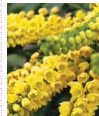
Mahonia x media 'Winter Sun'

Is winter dull? Not with these flowering plants in the garden. Around Wisley you'll find Clematis cirrhosa , camellias, including C. sasanqua , Iris unguicularis , and early I. reticulata , Cornus mas , Edgeworthia chrysantha , viburnums, mahonias, primulas, crocus, cyclamen, and many others in the Glasshouse and Alpine House.