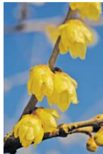
Chimonanthus praecox 'Luteus'

Enjoy the wintersweet, Chimonanthus praecox near the Laboratory and in the Walled Garden East. This Chinese native produces golden, highly scented blooms from December into February. The flowers are used in China to scent linen in the same way we use lavender.