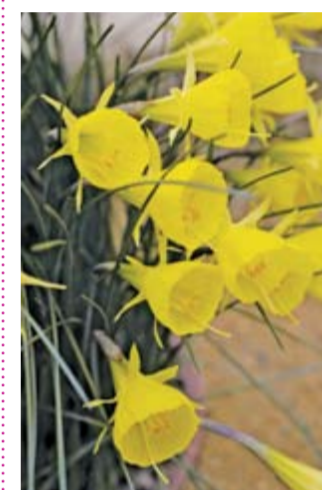
Narcissus bulbocodium subsp. bulbocodium

The Alpine House is one of the first places to see daffodils ( Narcissus ) in bloom. Delicate hoop-petticoat daffodils in white, pale and bright yellow are on display when they reach their peak. Outside in late winter large early daffodils include 'Rijnveld's Early Sensation', while small Narcissus cyclamineus throw back their petals in the woodland areas.