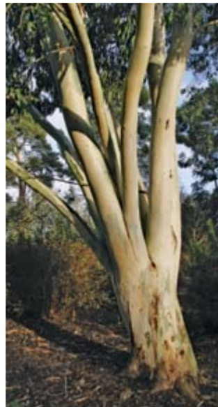
Eucalyptus dalympleana AGM

Five groups of Eucalyptus are recognisable by their bark – look at the designer camouflage of the mountain gum Eucalyptus dalympleana AGM, on the top of Battleston Hill. Clotted cream with splashes of subtle grey that darken to tank green. Notice how smooth the bark is. Stewartias or deciduous camellias, are other trees with similarly special bark.