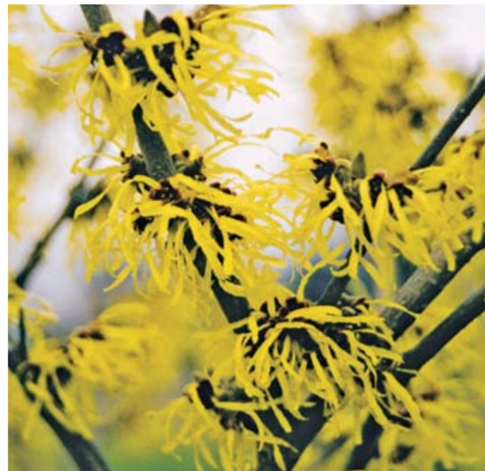
Hamamelis x intermedia 'Pallida' AGM

Spidery flowers in shades of red, orange and yellow look pretty. Take a deep breath and enjoy their fragrance as it is carried on the winter air. Hamamelis x intermedia 'Pallida' AGM (Seven Acres, Wild Garden, Battleston Hill) is one of the finest, with wonderful yellow scented flowers.