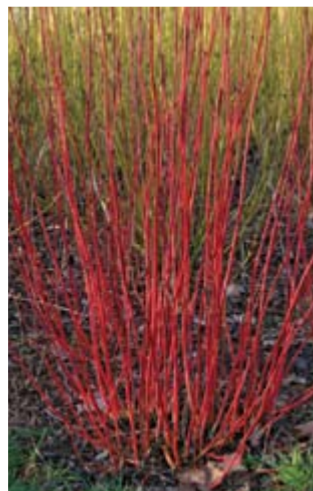
Cornus alba 'Sibirica'

Vibrant woody stems create a multicoloured display during winter. Cornus (dogwood), Salix (willow), Rubus (bramble) and Acer (maple) are the most significant, especially around the Seven Acres lake. Cornus 'Midwinter Fire' is one of the prettiest, changing from yellow to red along the length of each stem. And Cornus alba 'Sibirica' is one of the most vibrant.