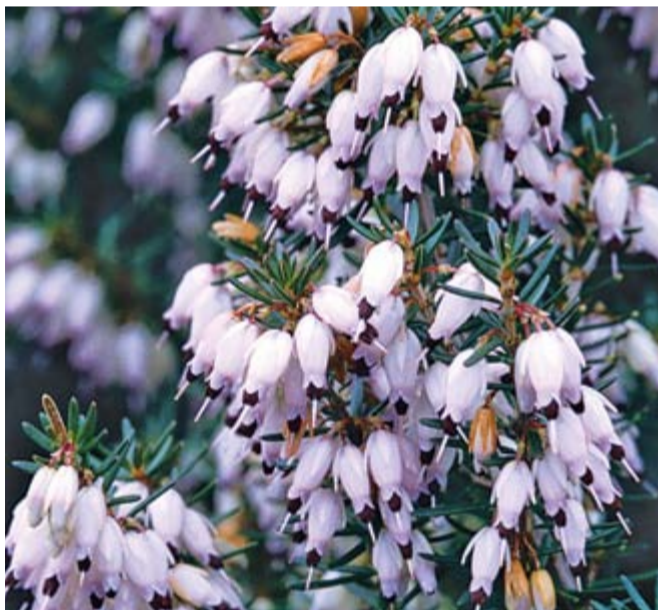
Erica x darleyensis 'Jenny Porter'

Howard's Field lies on the other side of the Pinetum and in winter will greet you with a carpet of winter-flowering heathers (mainly Erica x darleyensis and E. carnea cultivars).