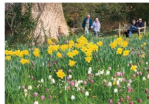
ROSEMOOR Great Torrington, North Devon