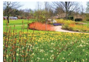
HARLOW CARR Harrogate, North Yorkshire

RHS Garden Wisley, Surrey GU23 6QB Tel: 0845 260 9000 Just off the A3, near J10 of the M25. rhs.org.uk/wisley