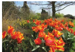
HYDE HALL Near Chelmsford, Essex