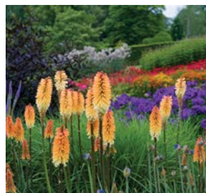
HARLOW CARR Harrogate, North Yorkshire