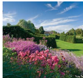
HYDE HALL Near Chelmsford, Essex