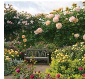
ROSEMOOR Great Torrington, North Devon

RHS Garden Wisley, Surrey GU23 6QB Tel: 0845 260 9000 Just off the A3, near J10 of the M25. rhs.org.uk/wisley