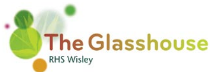
RHS Garden Wisley & The Glasshouse location map

For more information, or to make a booking, contact the Royal Horticultural Halls & Conference Centre, tel: 0207 821 3680 or visit www.rhs.org.uk/glasshouse