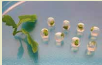
Cryoprotected chrysanthemum shoot tips

Initial studies by the School of Biological Sciences, University of Reading, using Chrysanthemum 'Euro' have shown that it is possible to preserve apical meristems in liquid nitrogen ( -196^{\circ}\text{C} ) and successfully recover and regrow the plants. They are now collaborating with the National Chrysanthemum Society to establish the first comprehensive collection of cryopreserved cultivars. Because of the small size of the stored tissue cultures, a vat occupying 1\text{m}^2 can house 1000 cultivars replicated many times over. The techniques developed allow for almost indefinite retention of the propagules.