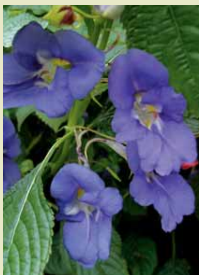
Ray Morgan, National Plant Collection Holder, Impatiens

In 2003 an unrecognised Impatiens was found by Yuan Yong-Ming and Ge Xue-Jun growing 200m from the Tsangpo river, at an altitude of 930m, in the Namcha Barwa Canyon. The Namcha Barwa Canyon is the deepest canyon in the world and is accessible only on foot, so remains relatively unexplored botanically. It was found only in a limited area, growing in open shrubland near the margins of a broad-leaved forest. Seed was collected and sent to the National Plant Collection of Impatiens for cultivation and in 2005 the holder of the Collection, together with the two discoverers of the plant published the new species name Impatiens namchabarwensis . It grows 40-50cm high and has thick fleshy roots, but it is mostly for its floriferous nature and its ultramarine blue flowers that it has considerable horticultural potential.