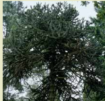
Janet Cubey / RHS Botany

Gardeners in the UK and elsewhere are constantly producing and selecting new forms of cultivated plants but, over time, some of these have been lost or are no longer available. For instance, just 6% of the cultivars listed in the International Daffodil Register are available in the UK as indicated in the RHS Plant Finder 2007–2008 . A similar figure would be found for most plant groups where we have this information. The NCCPG has, since its inception, been working to conserve plants in cultivation that are threatened, particularly through its National Plant Collections®, but there are still gaps and there is a need to establish how threatened many cultivated plants are. There is also an urgent requirement to improve the conservation management of plants in cultivation to ensure the purity of stock, to increase the genetic diversity of species in cultivation, and to be more aware of the heritage value of certain elements of that diversity.