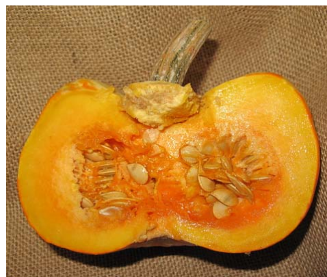
[Tn 13] 'Sweet Lightening'