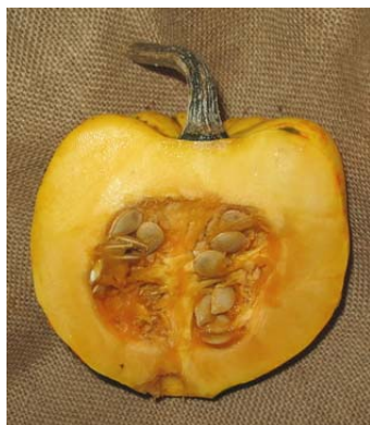
[Tn 2] 'Celebration'

Below is a selection of AGM cultivars halved to show their flesh to cavity ratio.