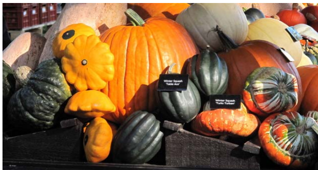
A selection of squash on display at the Wisley Taste of Autumn Fair 2010