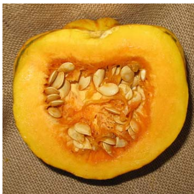
[Tn 7] 'Harlequin'