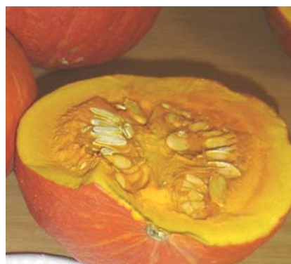
[Tn 30] 'Sunspot'