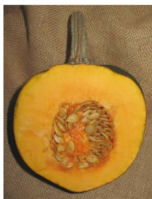
[Tn 9] 'Honey Bear'