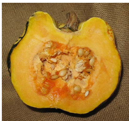
[Tn 12A] 'Sweet Dumpling'