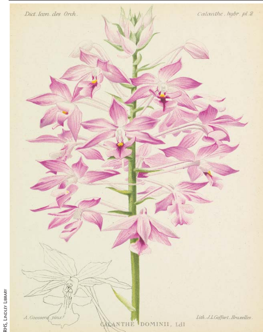
Fig. 2. Calanthe Dominyi gx. Chromolithograph from Célestin Cogniaux, Dictionnaire Iconographique des Orchidées (1903).