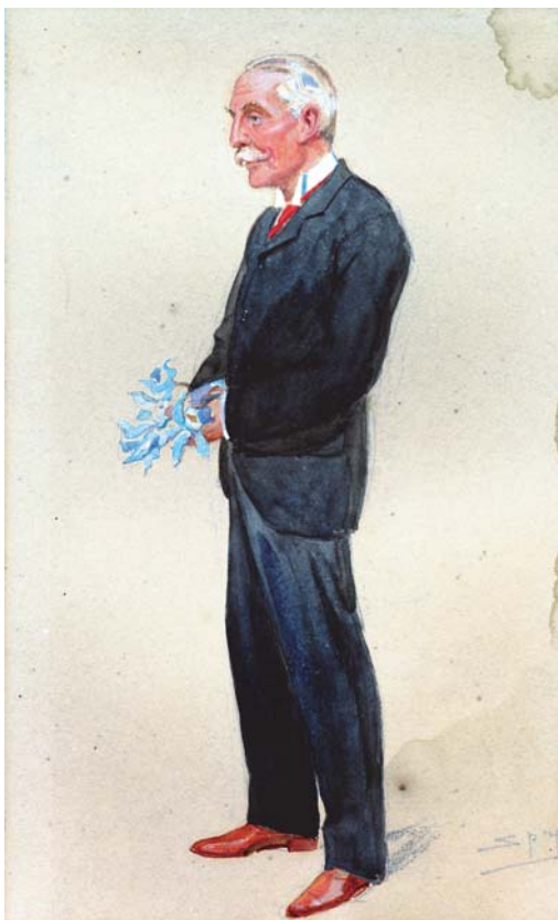
Fig. 7 (right). Sir Trevor Lawrence (1831–1913). Original drawing for cartoon by 'Spy' [Sir Leslie Ward], published in Vanity Fair , 26 January 1899.

and then to Haywards Heath in 1908, while Sander's remained the wealthiest and most cosmopolitan, with branches in St Albans, Bruges, and New York before the end of the nineteenth century.