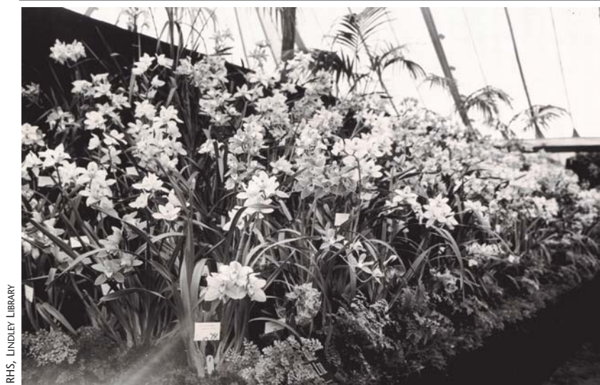
RHS, LINDLEY LIBRARY