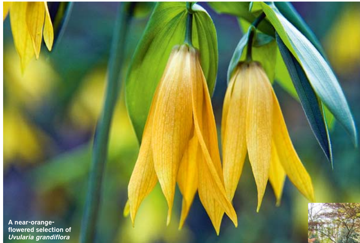
A near-orange-flowered selection of Uvularia grandiflora