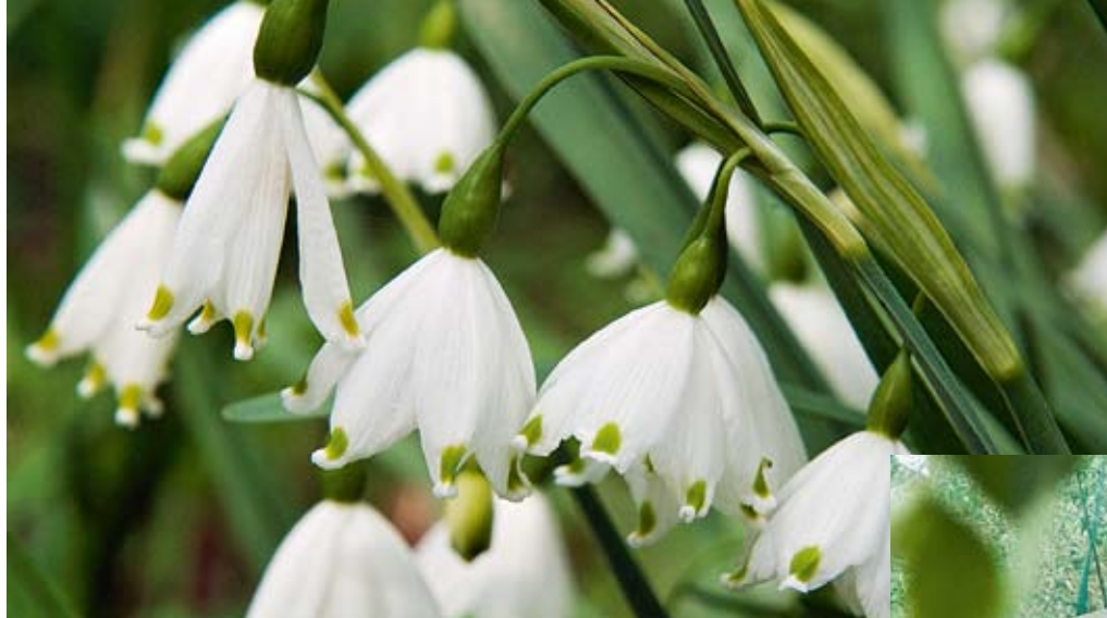
RARE NATIVE Charming Leucojum aestivum subsp. aestivum (left) grows wild on the banks of the River Avon and is sold by the nursery