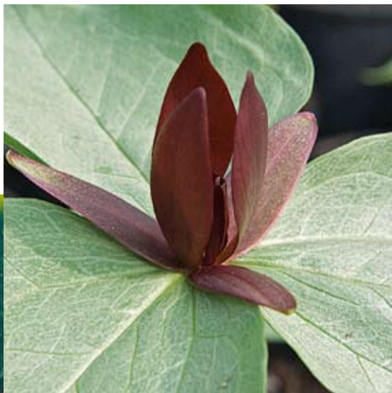
SILVER SELECTION Delectable Trillium cuneatum 'Moonshine' (above) is a remarkable silver-leaved strain selected by Kevin. It is, however, slow to propagate and few are available for sale. Roy and Kevin (left) discuss plants in a shade tunnel at Kevin's nursery in Wiltshire