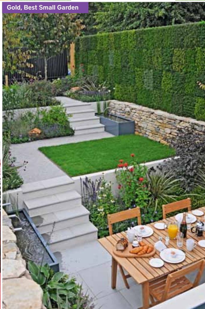
Gold, Best Small Garden