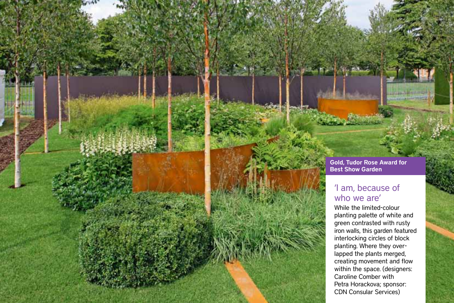
Gold, Tudor Rose Award for Best Show Garden