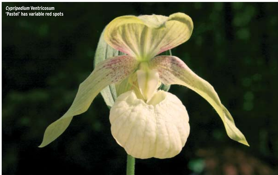
Cypripedium Ventricosum 'Pastel' has variable red spots

The broad leaves and strong stem make it a very stable garden plant that can even withstand strong rain or