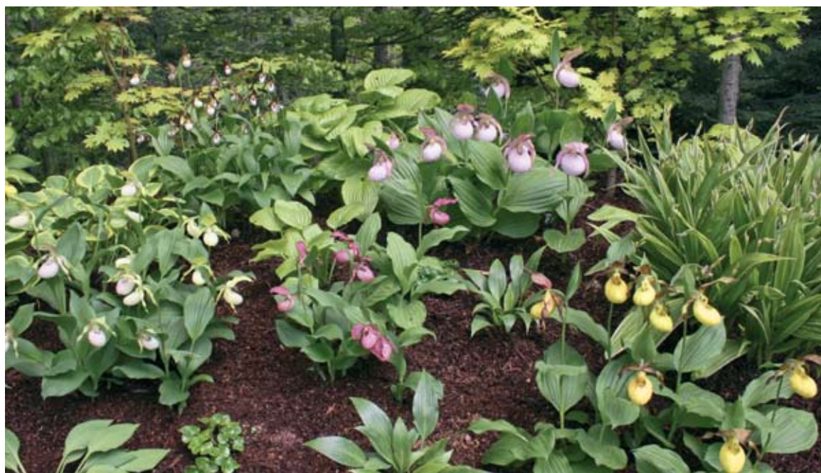
Cypripedium hybrids flourishing under Japanese maples, from left, C. Ventricosum 'Pastel', C. Sebastian , C. Ventricosum , C. Sabine and C. Sunny

wind. It grows 40–55cm tall and forms impressive clumps within a few years. I recommend it highly.