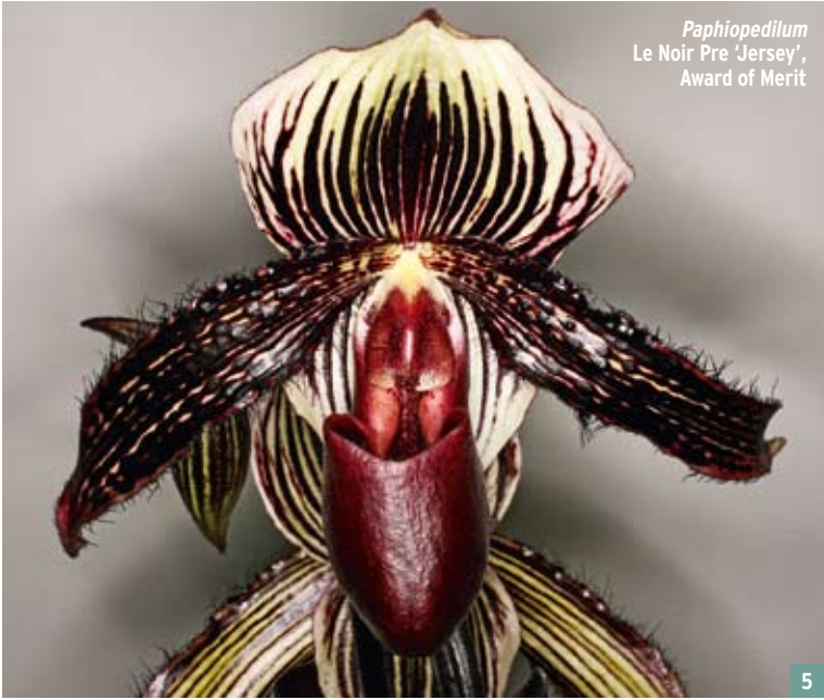
Paphiopedilum Le Noir Pre 'Jersey', Award of Merit