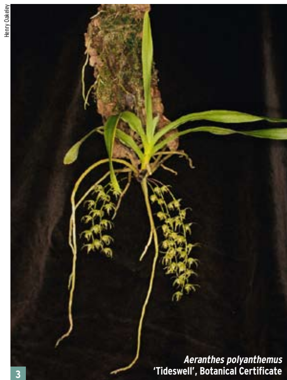
Aeranthes polyanthemus 'Tideswell', Botanical Certificate