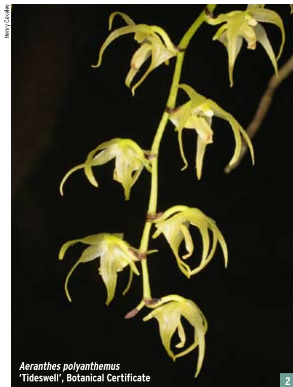
Aeranthes polyanthemus 'Tideswell', Botanical Certificate

The plant exhibited had a 19cm tall spike with two open flowers and one bud. Overall flower size was 140 x 160mm. The dorsal sepal and synsepal were white-green striped deep burgundy red. The dorsal sepal was 60 x 60mm; synsepal 60 x 40mm. Petal pale