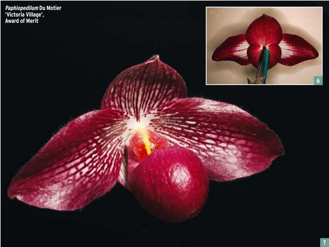
Paphiopedilum Du Motier 'Victoria Village', Award of Merit