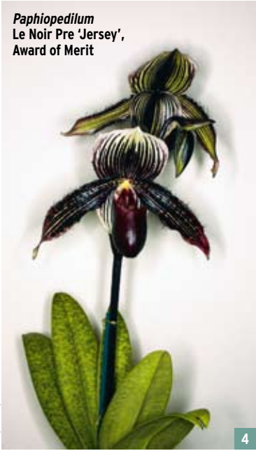
Paphiopedilum Le Noir Pre 'Jersey', Award of Merit