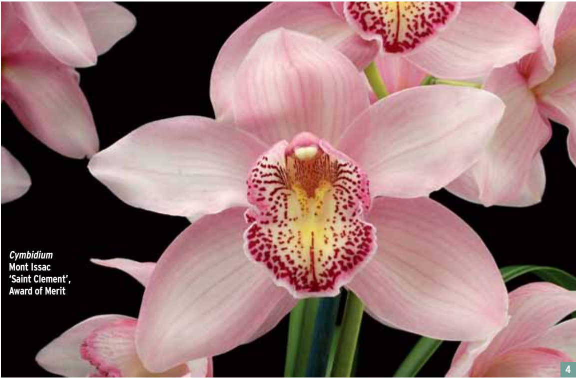
Cymbidium Mont Issac 'Saint Clement', Award of Merit