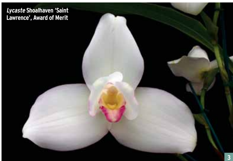
Lycaste Shoalhaven 'Saint Lawrence', Award of Merit