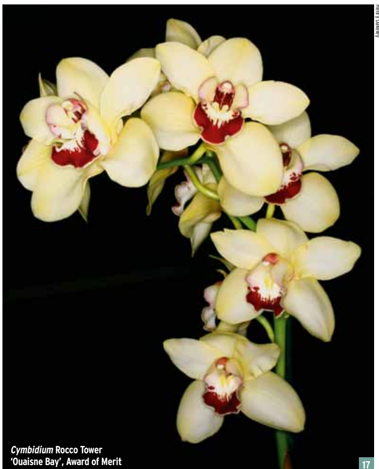
Cymbidium Rocco Tower 'Ouaisne Bay', Award of Merit

“ This plant is about 10-years-old, and we had recently divided it before deciding to put it up for an award. When judged, it had one old growth, the flowering