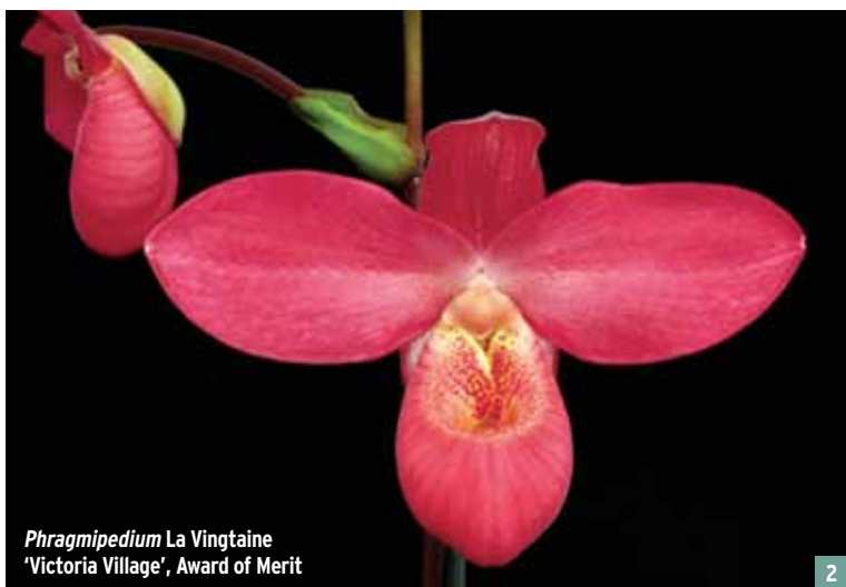
Phragmipedium La Vingtain 'Victoria Village', Award of Merit

The plant exhibited had one 75cm tall spike with two open flowers and two buds. The overall flower size was 110 x 140mm. The dorsal sepal was 50 x 25mm; synsepal cream and pink, 4 x 35mm. Petals 70 x 40mm;