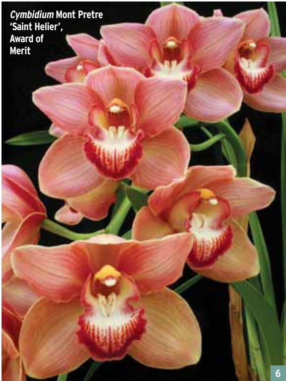
Cymbidium Mont Pretre 'Saint Helier', Award of Merit