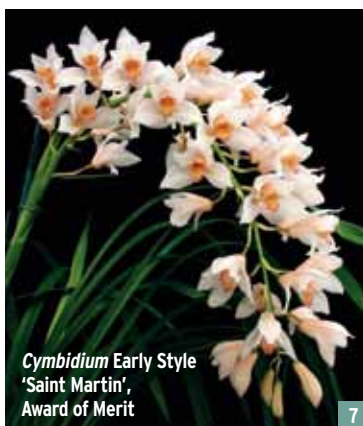
Cymbidium Early Style 'Saint Martin', Award of Merit

The plant exhibited had two 70 and 83cm tall spikes with nine and twelve flowers. The overall flower size was 110 x 135mm. Dorsal sepal 70 x 45mm; lateral sepals 70 x 45mm. Petals 70 x 35mm; lip 50 x 40mm, 45cm deep, pink heavily spotted red, yellow callus; column pink, 45mm long.