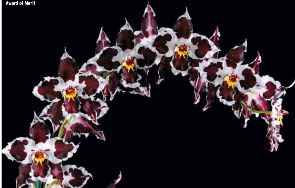
Odontioda Mont Fliquet 'Elizabeth Castle', Award of Merit