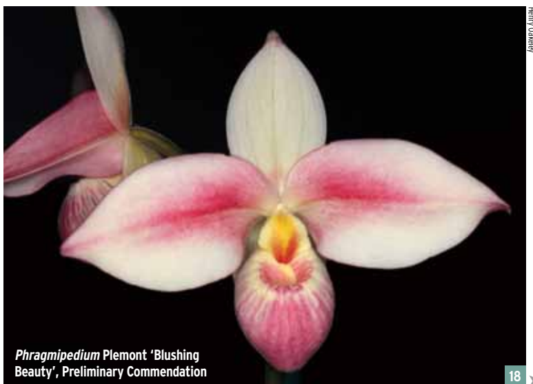
Phragmipedium Plemont 'Blushing Beauty', Preliminary Commendation