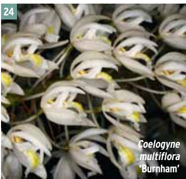
Coelogyne multiflora 'Burnham'