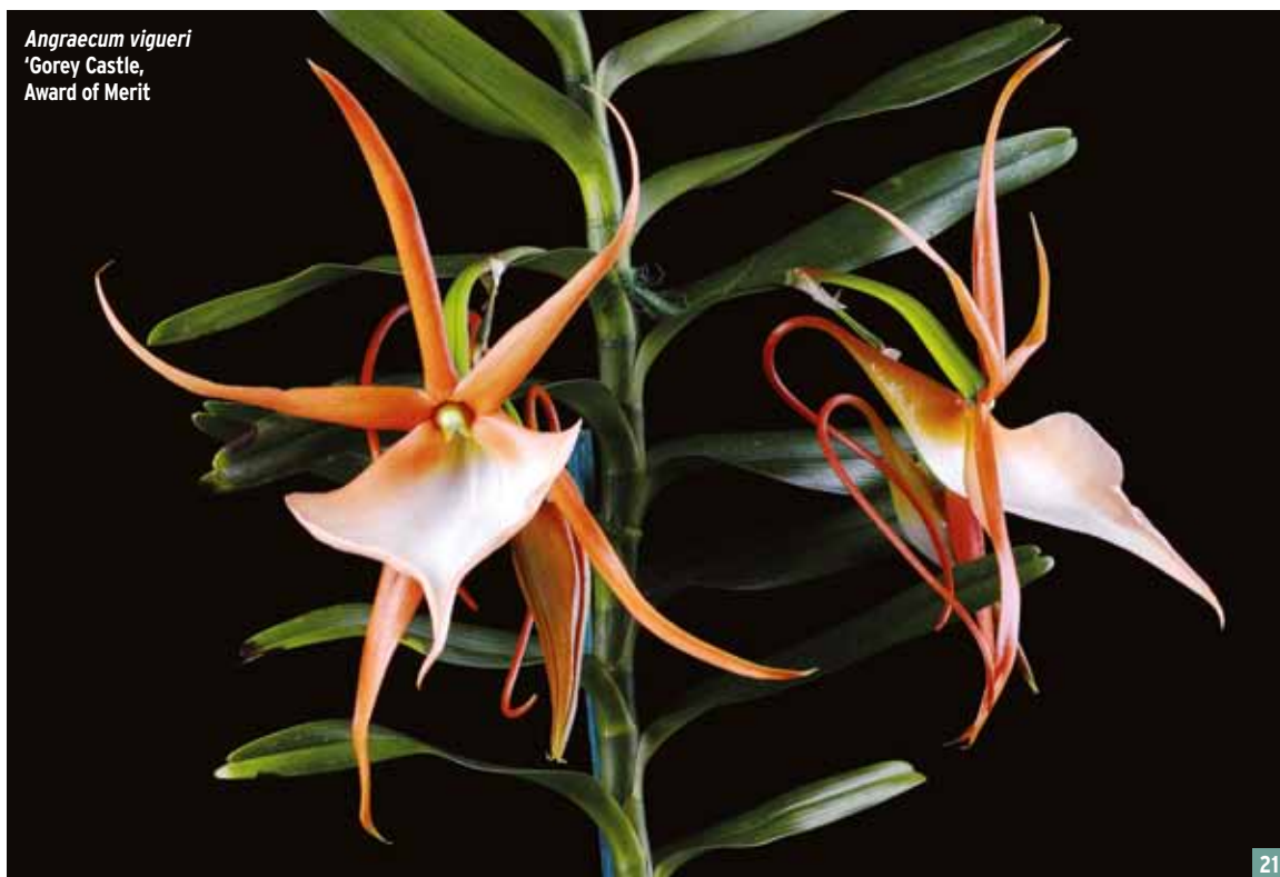
Angraecum vigueri 'Gorey Castle', Award of Merit