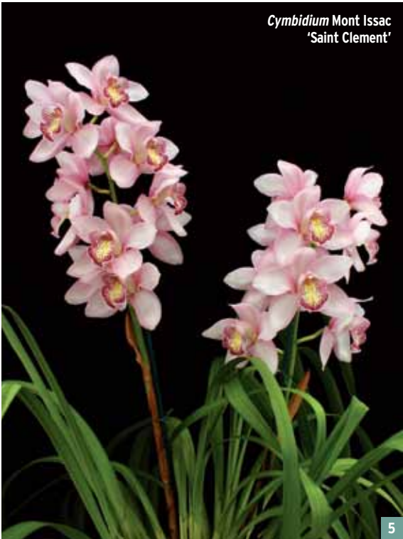
Cymbidium Mont Issac 'Saint Clement'