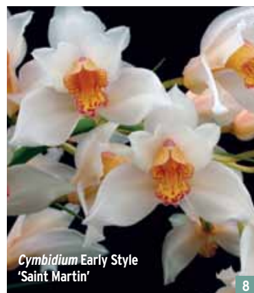
Cymbidium Early Style 'Saint Martin'