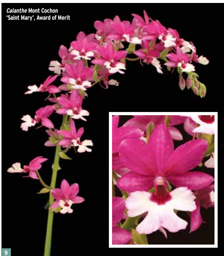
Calanthe Mont Cochon 'Saint Mary', Award of Merit

The plant exhibited had one 95cm spike with fourteen open flowers. The overall flower size was 80 x 110mm. Dorsal sepal 65 x 45mm; lateral sepals 75 x 45mm. Petals 70 x 40mm; lip 50 x 40mm, 45mm deep, cream, red edge, spotted red; column yellow, 50mm long.