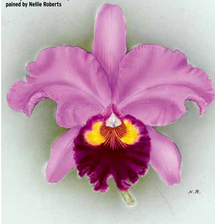
Cattleya Stalin 'Rivermont', painted by Nellie Roberts

There have been rare occasions when it is obvious, even to the registrar, that a suggested grex epithet is intended to insult a third party. In such cases the registrar discusses the options for alternative names with the registrant.