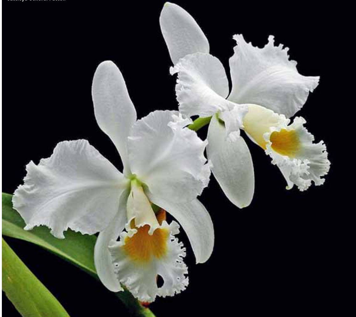
Cattleya General Patton

made an announcement outlining the facts of the case and commenting that, 'the rules admit of no alteration'. Their announcement concluded with an apposite quote from Omar Khayyam (1048–1131), evidently cited here to underscore the immutability of established plant names: 'The Moving Finger writes, and, having writ, Moves on: nor all thy Piety nor Wit Shall lure it back to cancel half a Line, Nor all thy Tears wash out a Word of it.' (from The Rubáiyát of Omar Khayyám ). But is this really the case with plant names?