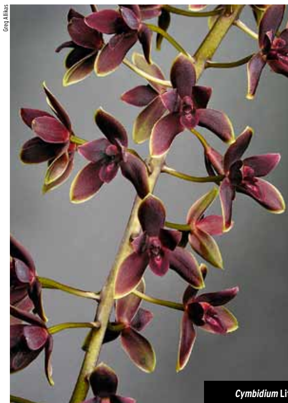
Cymbidium Little Black Sambo