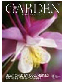
May 2010 pp293–376