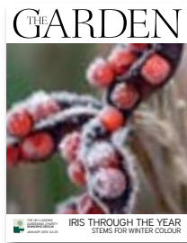
January 2010 pp1–70