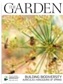
April 2010 pp219–292