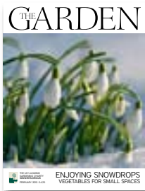
February 2010 pp71–142