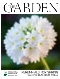
March 2010 pp143–218