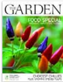
April 2007 Food special issue pp211–282