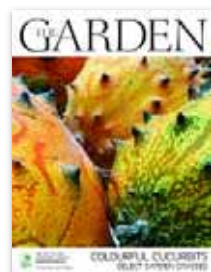
November 2007 pp705-774