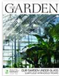
June 2007 pp357–432

Numbers in italics denote a picture or illustration