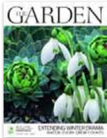
February 2007 pp69–138