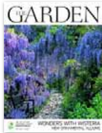
May 2007 pp283–356