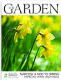
March 2007 pp139–210