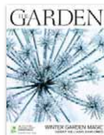
December 2007 pp775-842