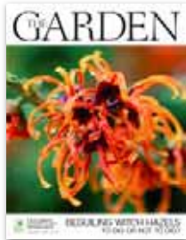
January 2007 pp1–68