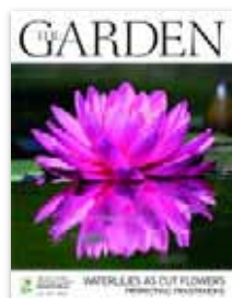
July 2007 pp433-502