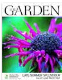
September 2007 pp569-642