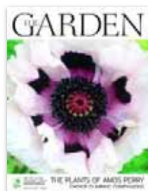
August 2007 pp503-568