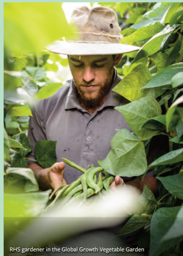
RHS gardener in the Global Growth Vegetable Garden