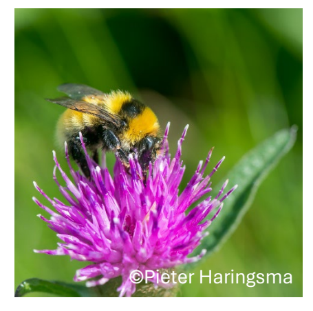
Great Yellow bumblebee

The exhibit represents four key bumblebee habitats. The first is gardens with a diversity of flowers throughout the year, which can provide vital habitats for many of our bumblebees. The second is Machair, a low-lying coastal grassland, found only on the western shores of northern Scotland and Ireland. Machair provides a vital last refuge for the rare great yellow bumblebee. Moorlands are the third habitat, usually found in upland areas and dominated by dwarf shrubs such as heather and bilberry, providing habitat for rare bilberry bumblebees. The last habitat is species rich grasslands, in the south of England and Wales, which support the last few fragile populations of the UK's rarest bumblebee, the shrill carder bumblebee.