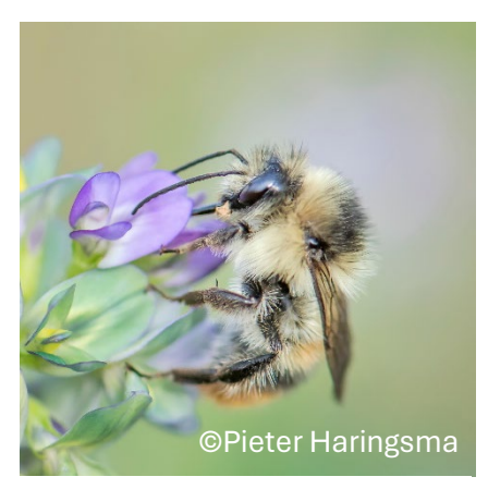
Shrill carder bumblebee