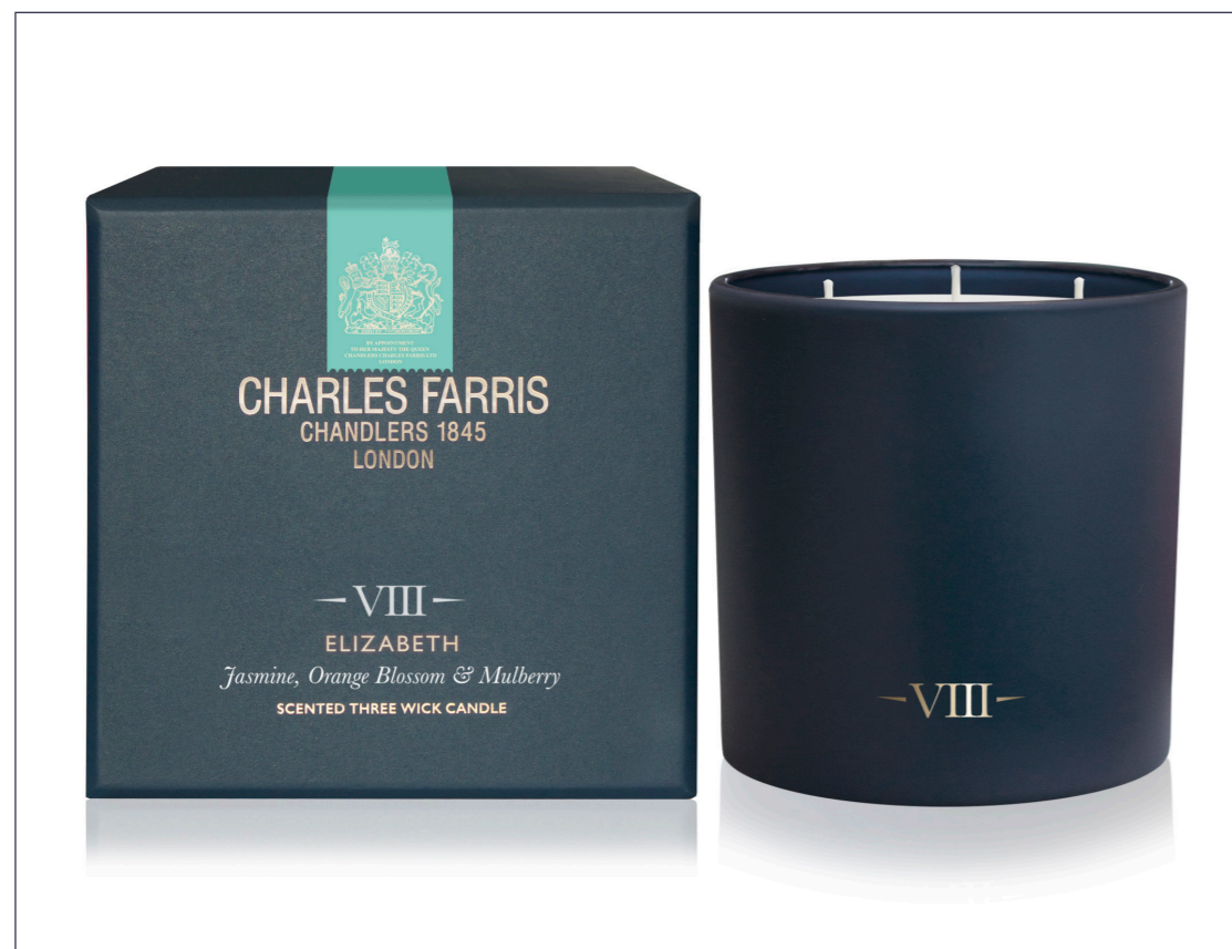
3 Wick Candle 640g