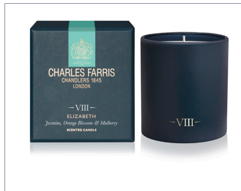
Single Wick Candle 210g