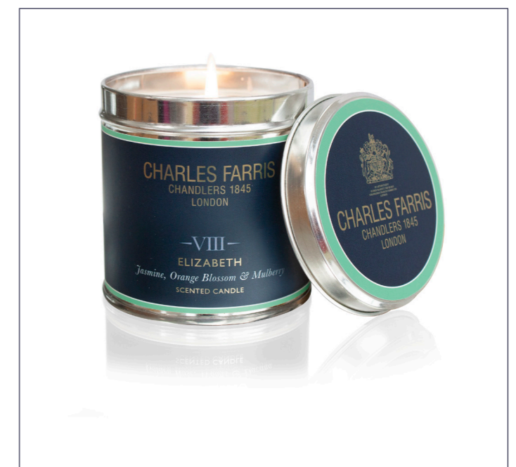
Signature Tin 300g