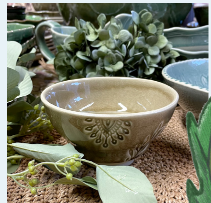
- Sthal -