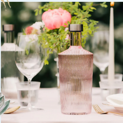
- Paveau -