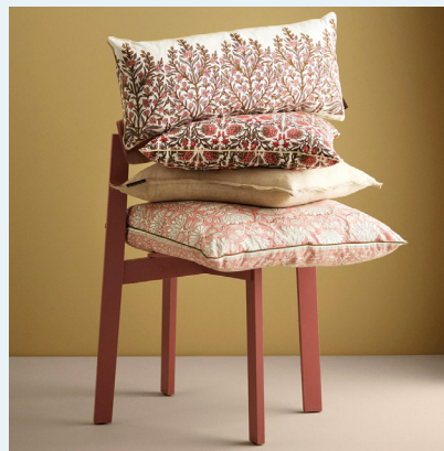
- Bungalow DK -