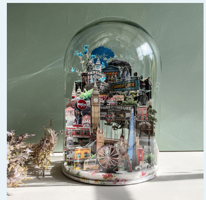
- The Map -