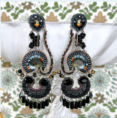
- Ayala Bar -