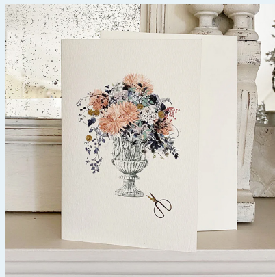
- Elena Deshmukh -