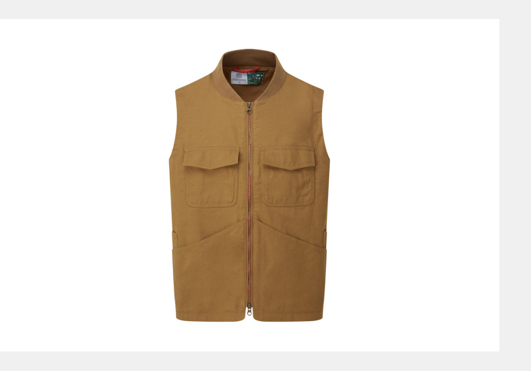
RHS Urban Show