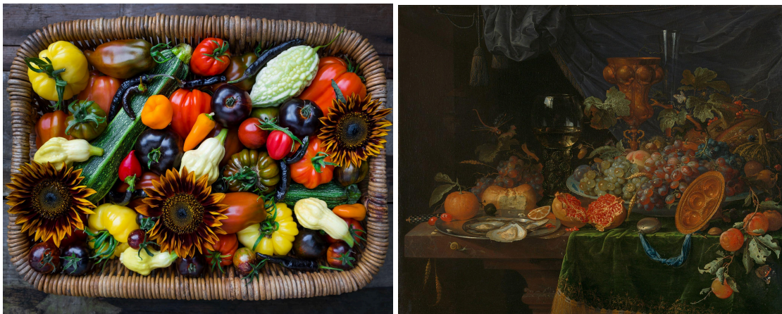
She Grows Veg Basket vs Still Life with Fruit and Oysters, Abraham Mignon

We are the UK’s new heirloom seed company, She Grows Veg , bringing our ‘edimental’ heirloom veg exhibit to RHS Chelsea Flower Show for the first time. We sell beautiful edible veg, fruit, tree and plant seeds to customers in the UK.