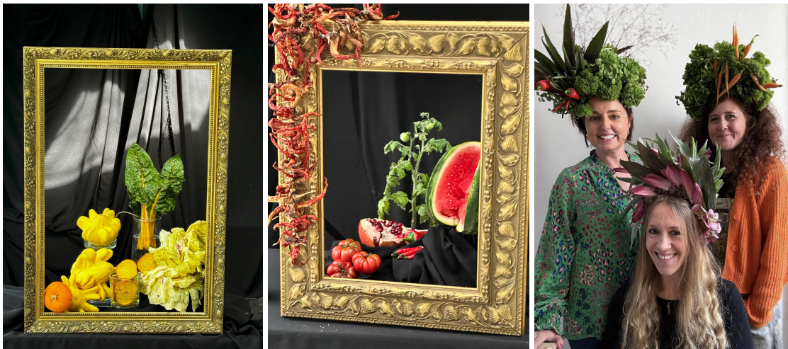
Recent Mock-up Days for Chelsea Prep