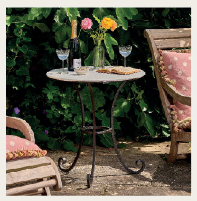
NEW Wrought Iron & Marble Top Side Table £645