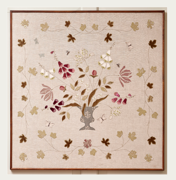
NEW Foxgloves & Tulips Wallhanging £695