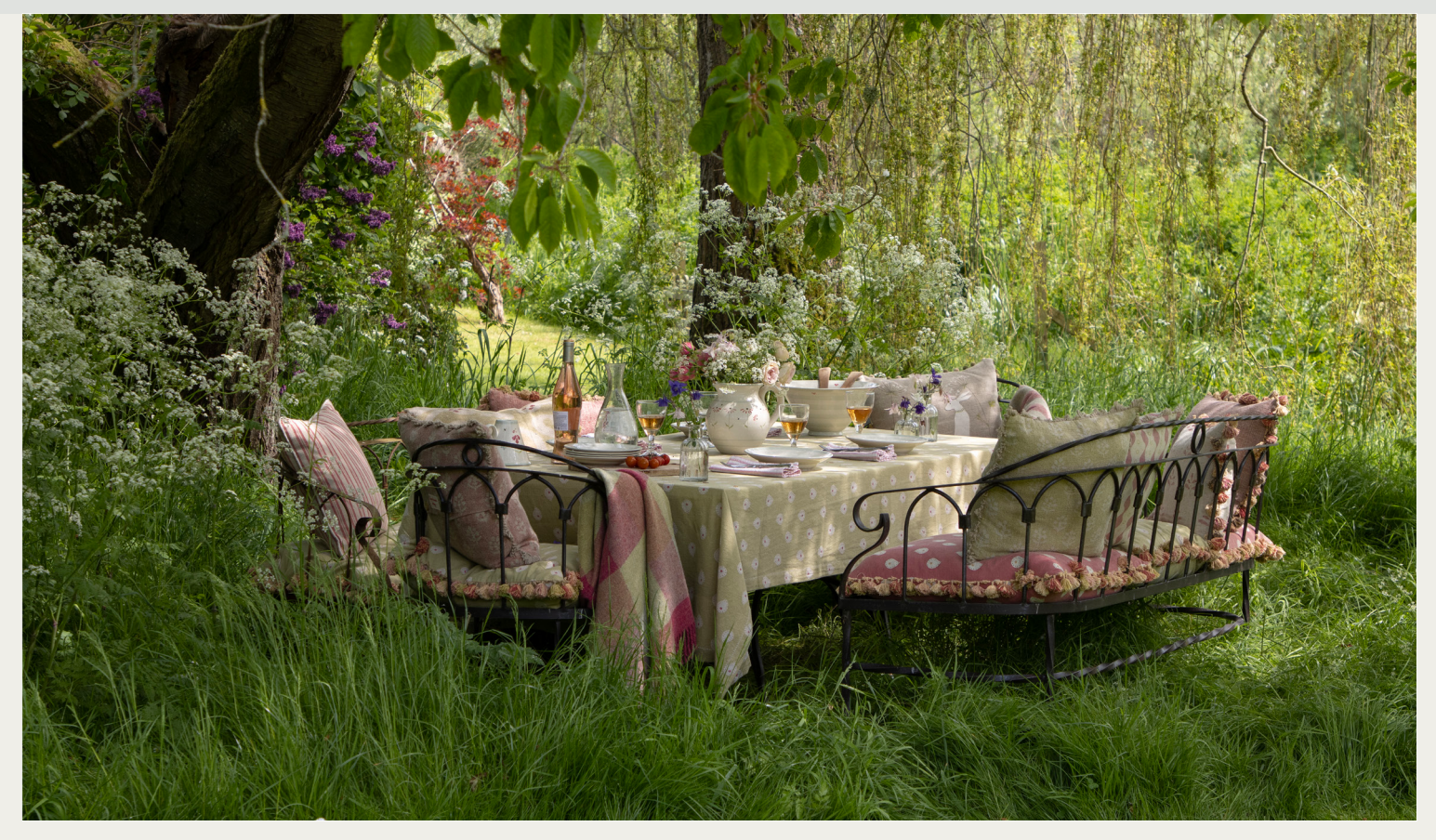
Green Mika Tablecloth from £120, Wrought Iron Garden Chair £425, Wrought Iron Garden Bench from £795