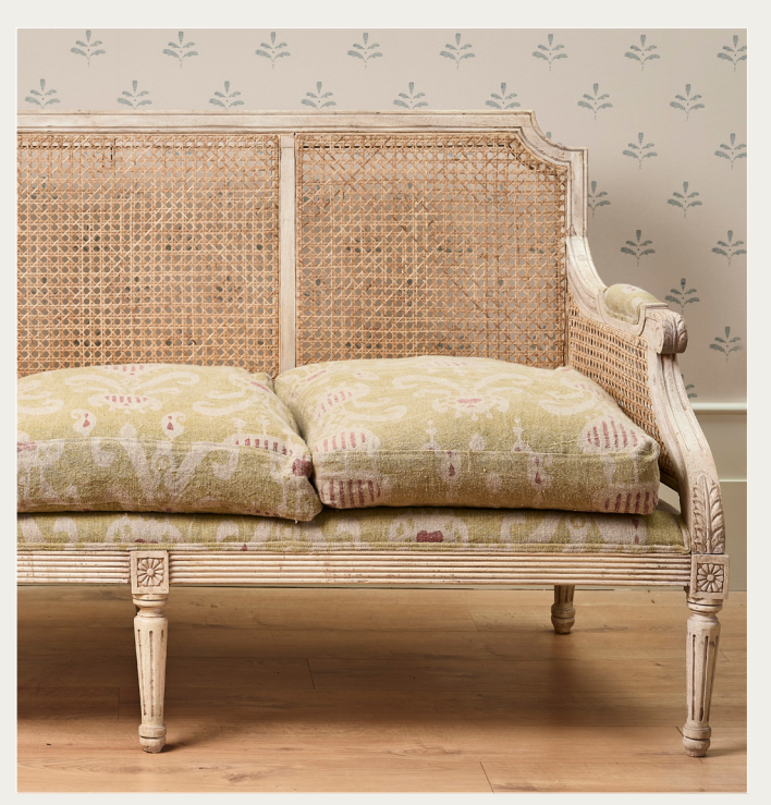
Large Caned Sofa £3,150