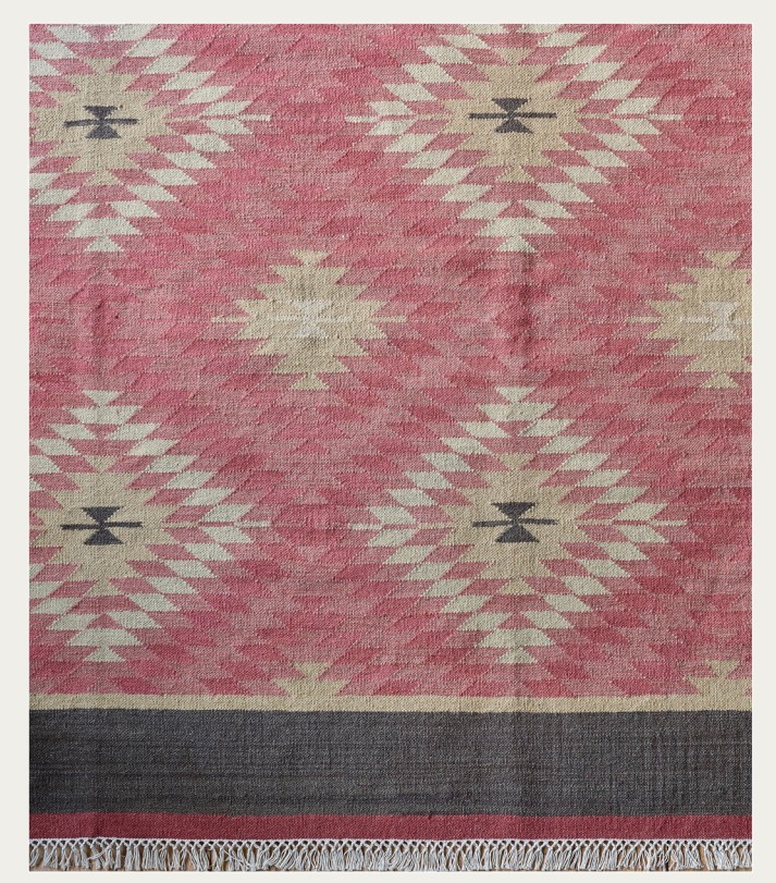
NEW Rose Shimla Kilim Rug £1,245