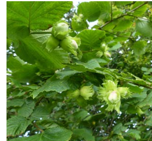
Corylus avellana (hazel)

Rodgersia 'Bronze Peacock' Rodgersia 'Bronze Peacock' Rodgersia podophylla 'Braunlaub' Saruma henryi Silene fimbriata Smyrniium perfoliatum Thalictrum delavayi 'Album' Thalictrum delavayi 'Splendide White' (PBR) Thalictrum 'Black Stockings' Trollius x cultorum 'Cheddar' Trollius x cultorum 'New Moon' Viburnum lantana