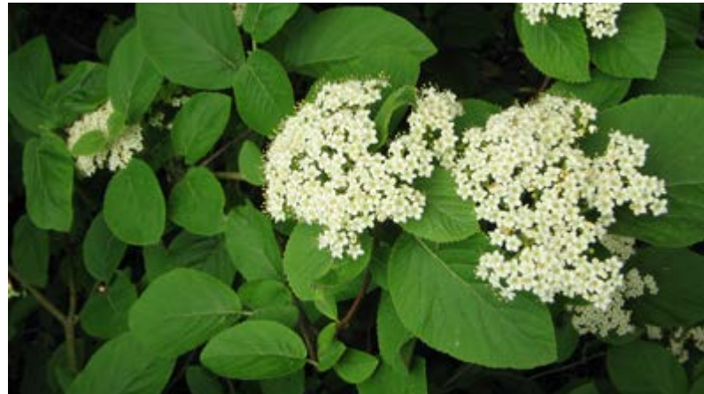
Viburnum lantana (native)