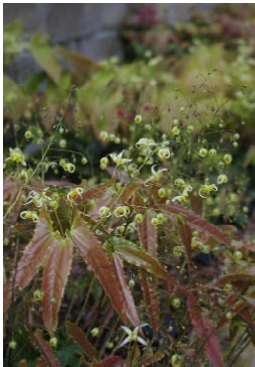
Epimedium 'Spine Tinger'