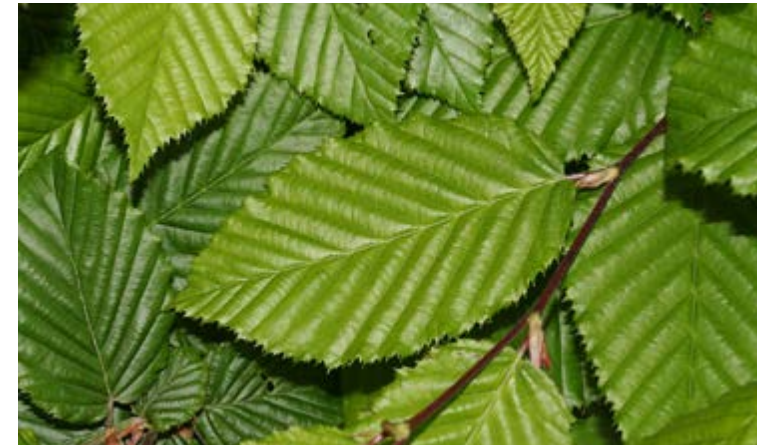
Carpinus betulus (native)