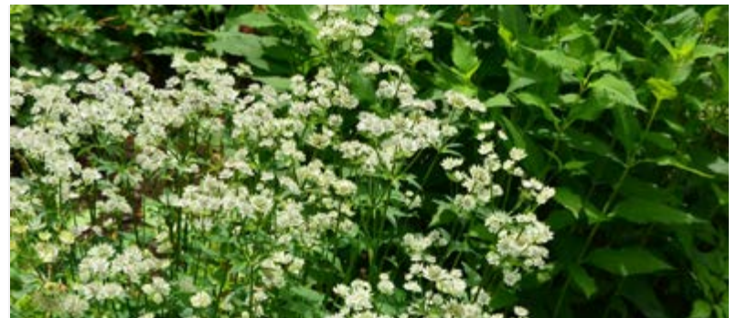
Astrantia major 'Star of Billion'