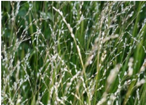
Melica altissima 'Alba'