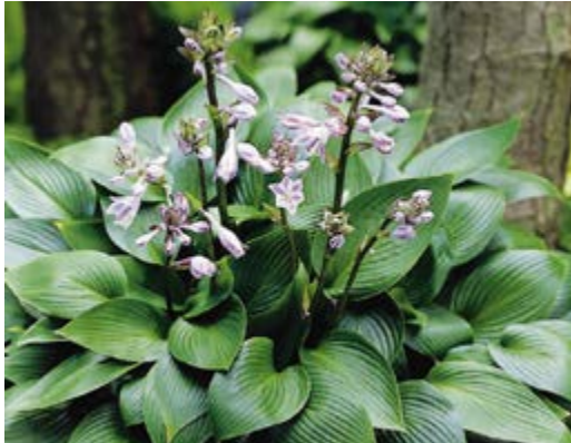
Hosta 'Devon Green'