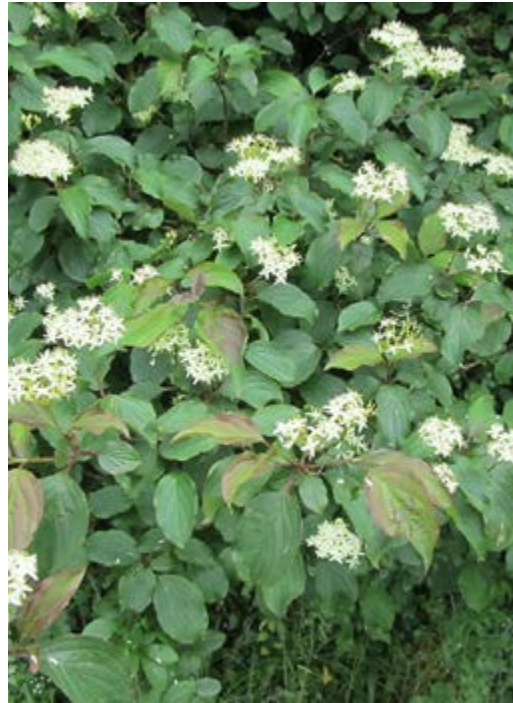
Cornus sanguinea (native)