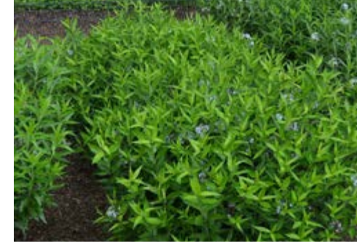
Amsonia tabernaemontana 'Storm Cloud'