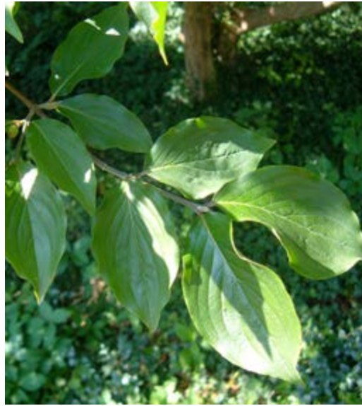
Cornus mas (non-native)