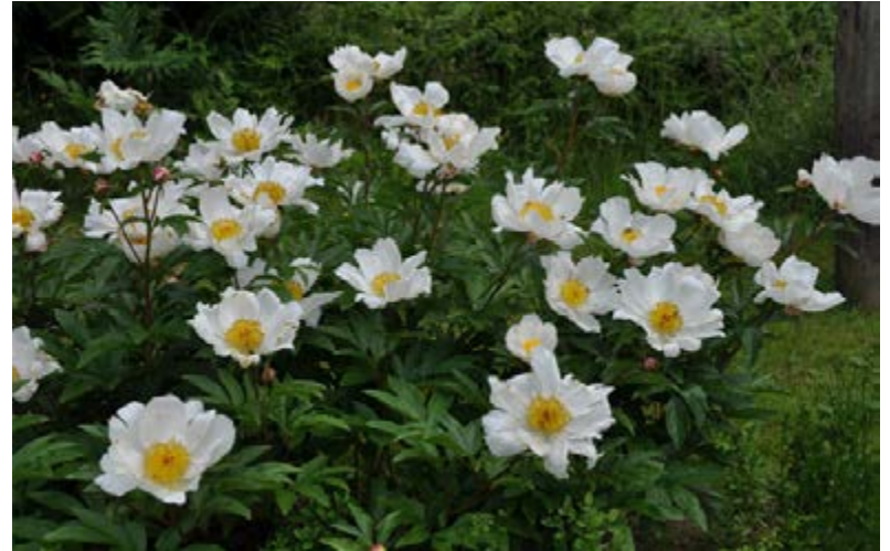
Paeonia lactiflora 'White Wings'