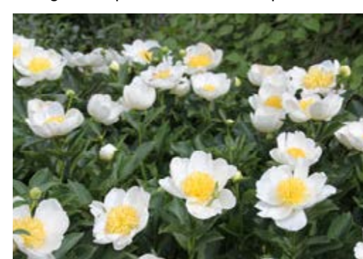
Paeonia lactiflora 'Jan van Leeuwen'