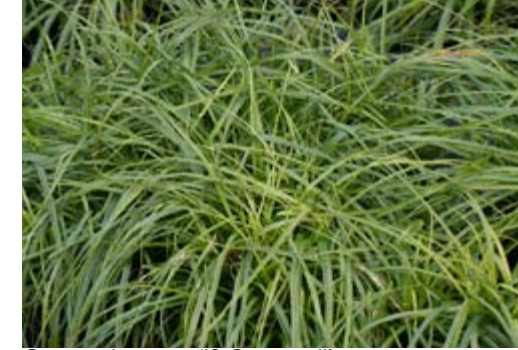
Carex oshimensis 'JS Greenwell'