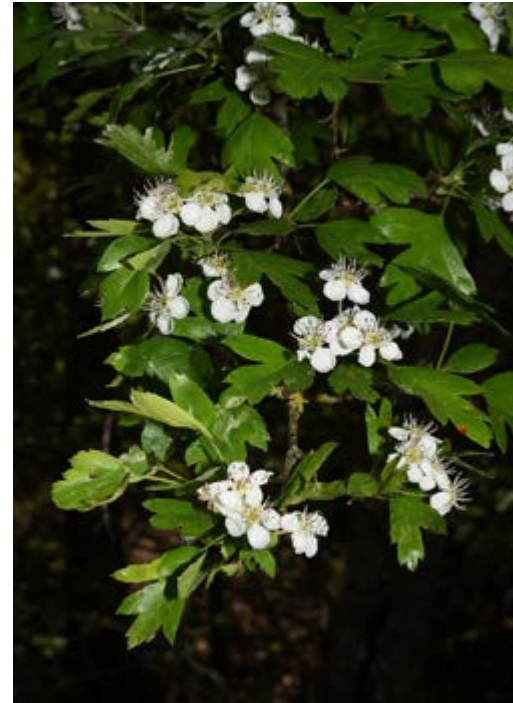
Crataegus monogyna (native)