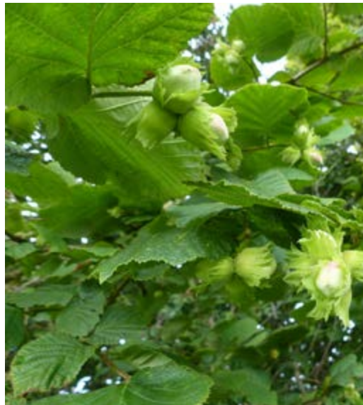
Corylus avellana (native)