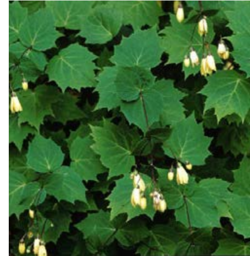
Kirengeshoma palmata Korean Group