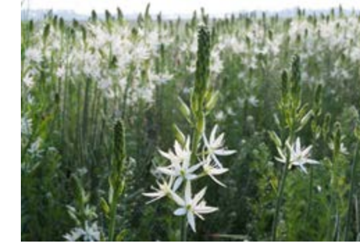
Camassia leichtlinii 'Alba'