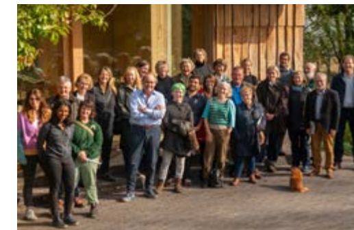
Some of the plants used in the garden have been kindly donated by owners of gardens which open for the National Garden Scheme