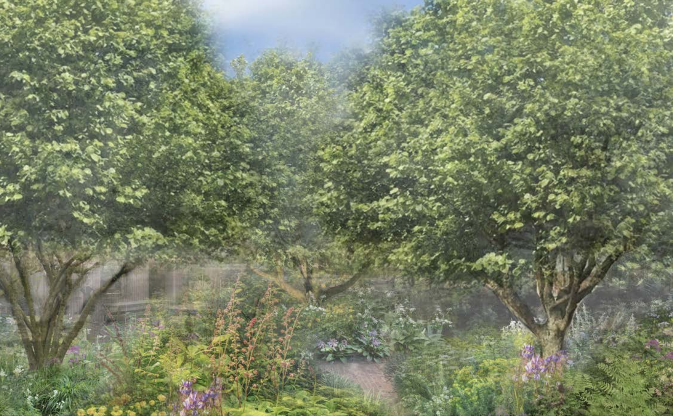
The National Garden Scheme Garden designed by Tom Stuart-Smith, brought to life by Crocus and fully funded by Project Giving Back