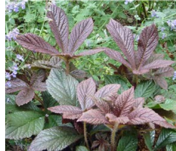
Rodgersia 'Bronze Peacock'