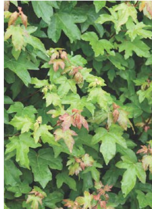
Acer campestre (native)