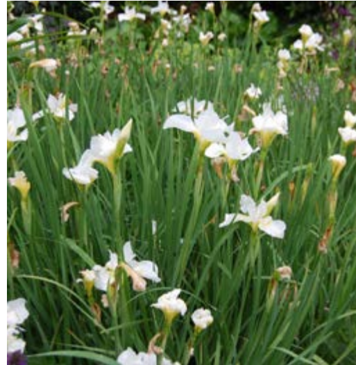
Iris sibirica 'White Swirl'