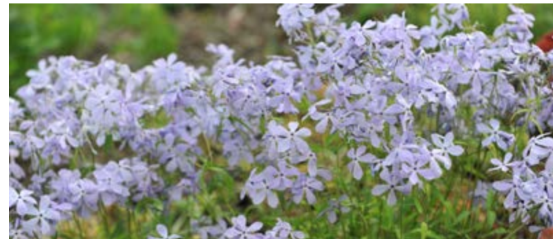
Phlox divaricata 'Clouds of Perfume'