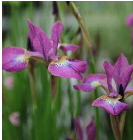
Iris sibirica 'Sparkling Rose'