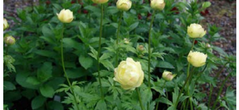
Trollius x cultorum 'New Moon'