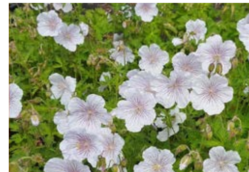
Geranium himalayense 'Derrick Cook'