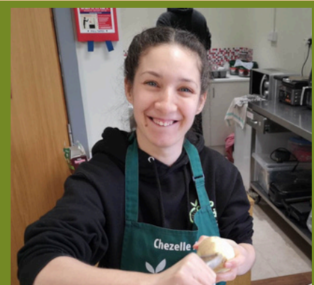
Chezelle Pulp Friction Member Front of House Team