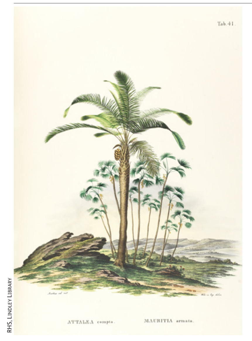
Fig. 5. Plate 41 from Volume 2 of Historia naturalis palmarum by Carl Friedrich Philipp von Martius (1794–1868).