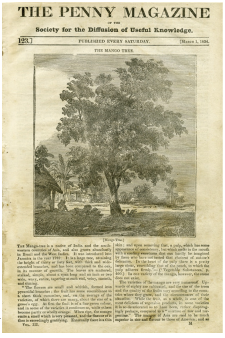
Fig. 1. First page of a specimen issue of the Penny Magazine . This woodengraving was not used in the Penny Cyclopaedia .