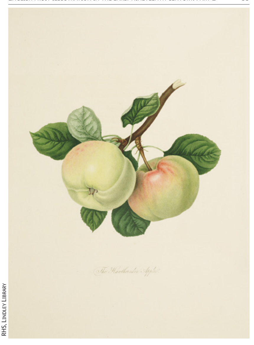
Fig. 2. Apple 'Hawthornden', from Hooker's Pomona Londinensis.