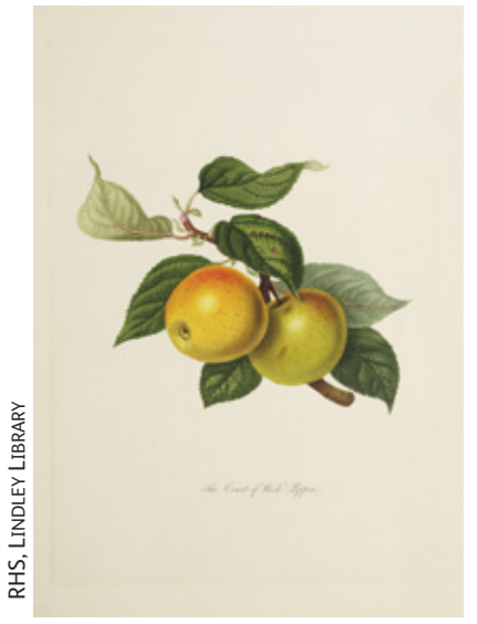
Fig. 3. Clockwise from top left. Apple 'Court of Wick Pippin': Hooker fruit drawing, 1816; Pomological Magazine, June 1828; Pomona Londinensis.