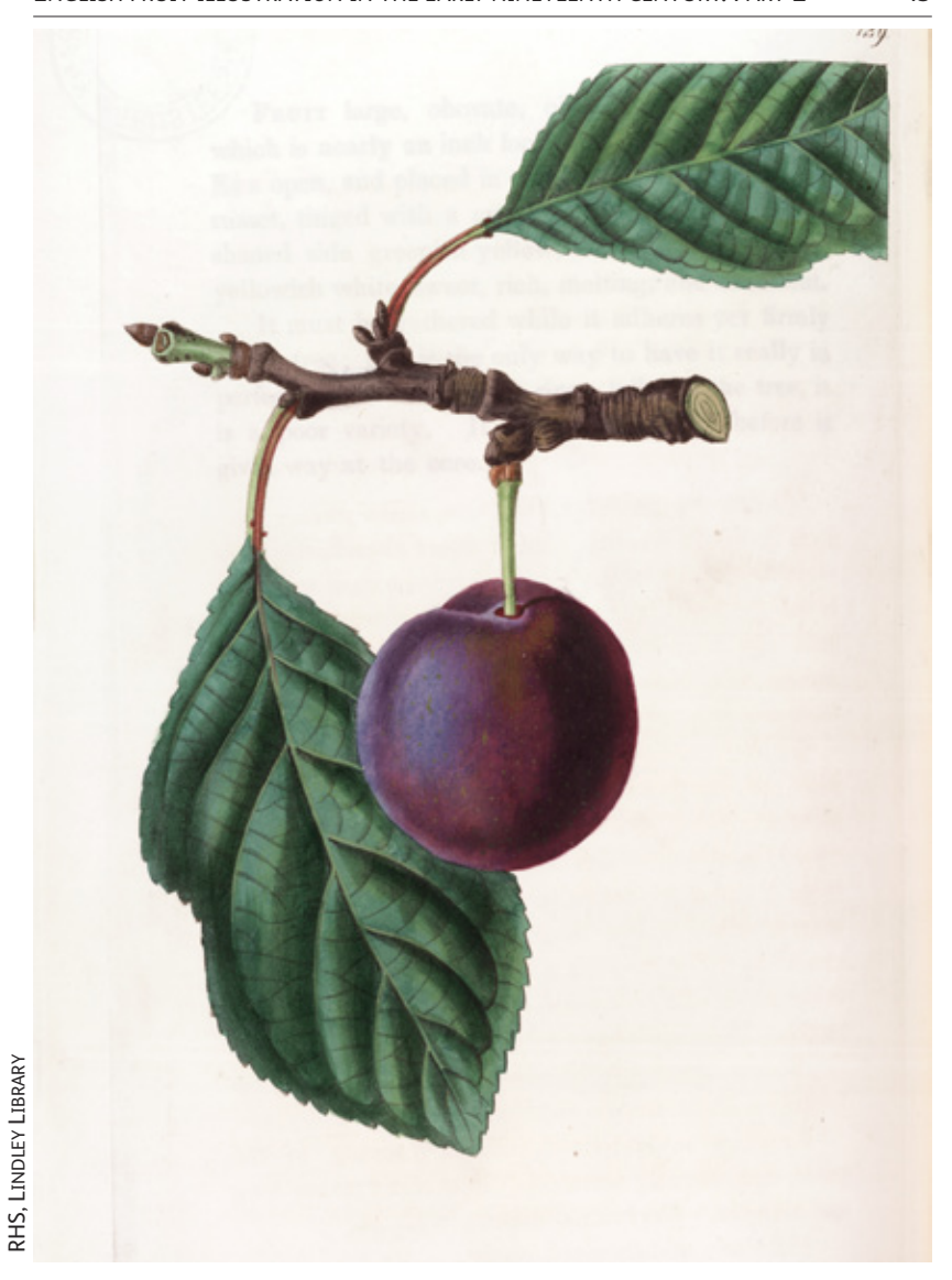
Fig. 4. Plum 'Purple Gage', from Pomological Magazine, July 1830.