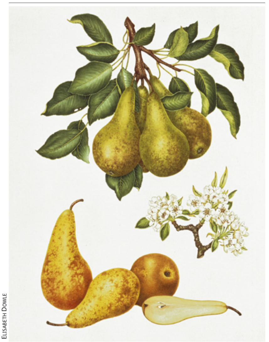
Fig. 7. The 'Conference' pear, drawn by Elisabeth Dowle. The most widely planted pear in England by the 1920–30s, the standard by which all other mid-season pears were judged in the National Fruit Trials and now the main pear of England and northern Europe.