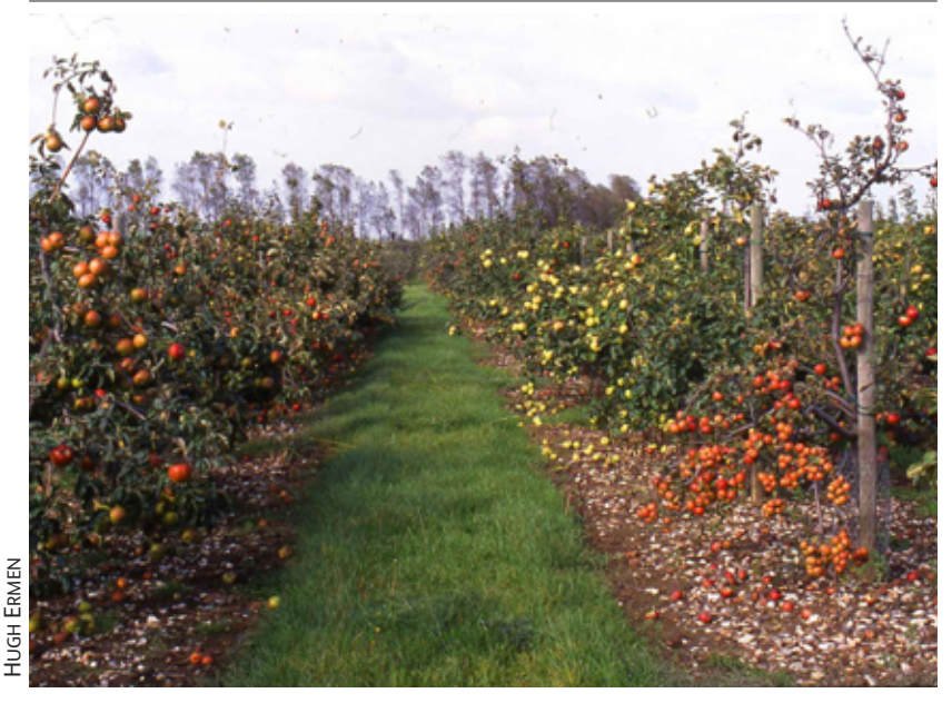
Fig. 1. Part of the present apple collection in the National Fruit Collection, Brogdale, Kent.

was very little, if any, continuity of material between them. Even so, the background to today's collections is closely bound up with the story of nineteenth-century horticulture. The reason for the creation of both the Chiswick orchard and the National Fruit Collection was the same: to resolve the confusion of different names acquired by cultivars as they were propagated and distributed from country to country, region to region, and through nurserymen re-introducing old cultivars under new names. That a tree was the true cultivar was crucially important, since planting the wrong one resulted in years of disappointment and loss of potential return for the market grower and private gardener. The solution lay in a collection of cultivars, verified as correct through checking against published descriptions, and at the same time documenting the new introductions. The intention was that this would then serve as a living reference library for sorting out synonyms as well as identification of unknown samples and a verified source of scion wood for the propagation of new trees: roles which the present collections continue to fulfil.