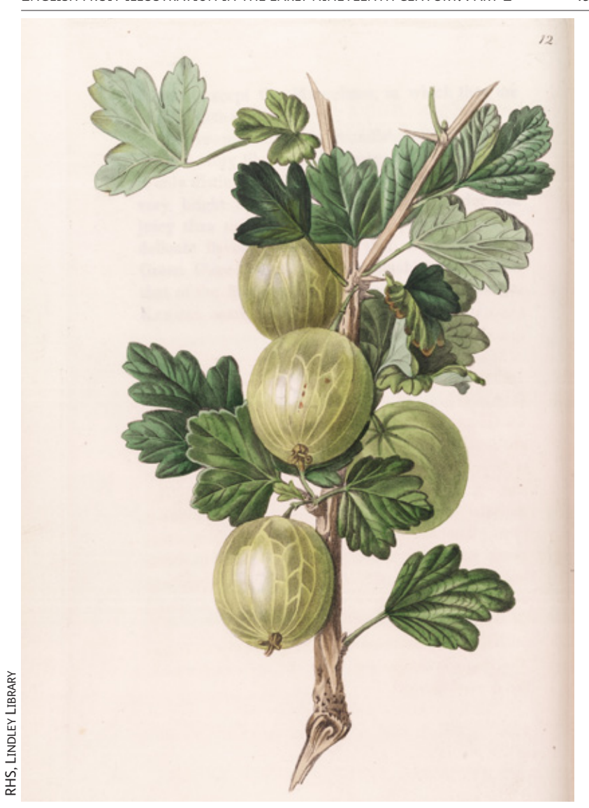
Fig. 6. Gooseberry 'Crompton's Sheba Queen', Pomological Magazine, 1828.