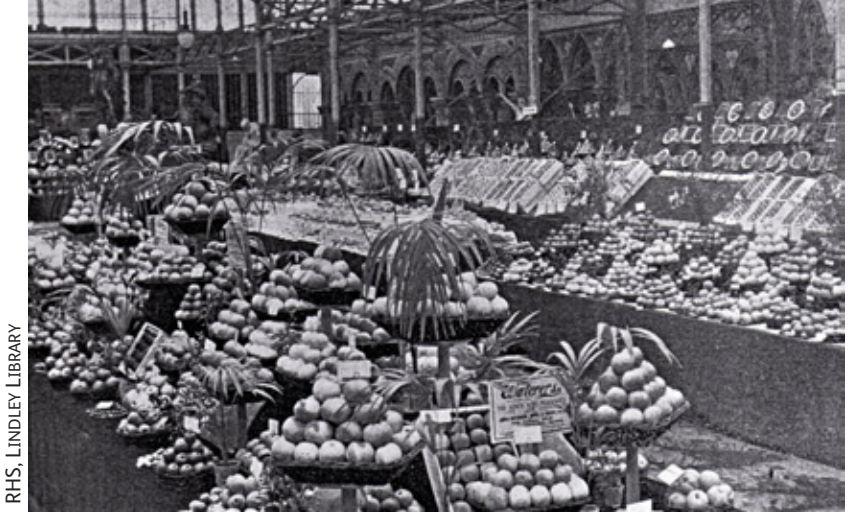
Fig. 2. Top. The RHS National Apple Congress of 1883, staged in the Chiswick vinery. Bottom. The 1934 RHS Autumn Show, which also marked the fiftieth anniversary of the 1883 Apple Congress and 1885 Pear Conference.