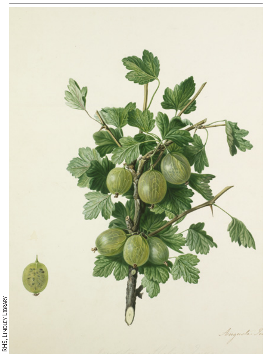
Fig. 5. Gooseberry 'Compton's [sic] Sheba Queen', drawn by Withers for the Horticultural Society, 1825.