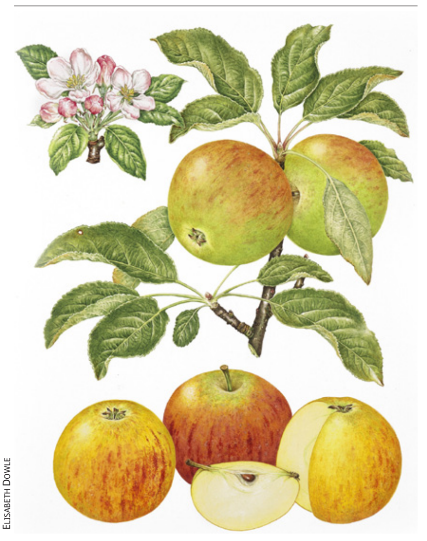
Fig. 3. The 'Cox's Orange Pippin' apple, drawn by Elisabeth Dowle. England's most loved apple – the top dessert cultivar in 1883, voted the best-flavoured apple of all at the RHS fruit shows of the 1890s, and our main market apple until recent times.