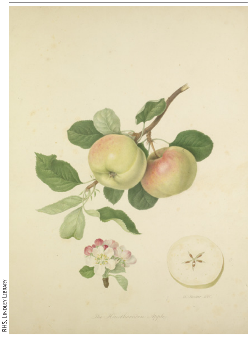
Fig.\ 1.\ Apple\ 'Hawthornden', drawn\ by\ Hooker\ for\ the\ Horticultural\ Society,\ 1816.