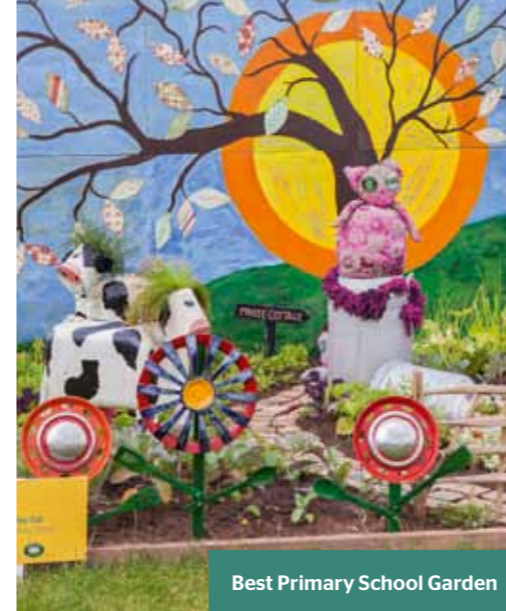
Best Primary School Garden