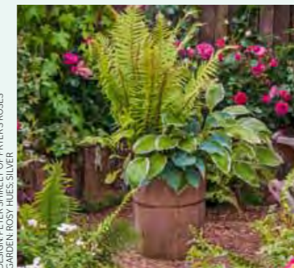
DESIGN: PETER SHIRLEY OF FRYER'S ROSES GARDEN: ROSY HUES, SILVER

Well-planted containers can become focal points: this simple wooden bucket teeming with ferns with hostas held its own (by dint of contrast) among a great many rose blooms.