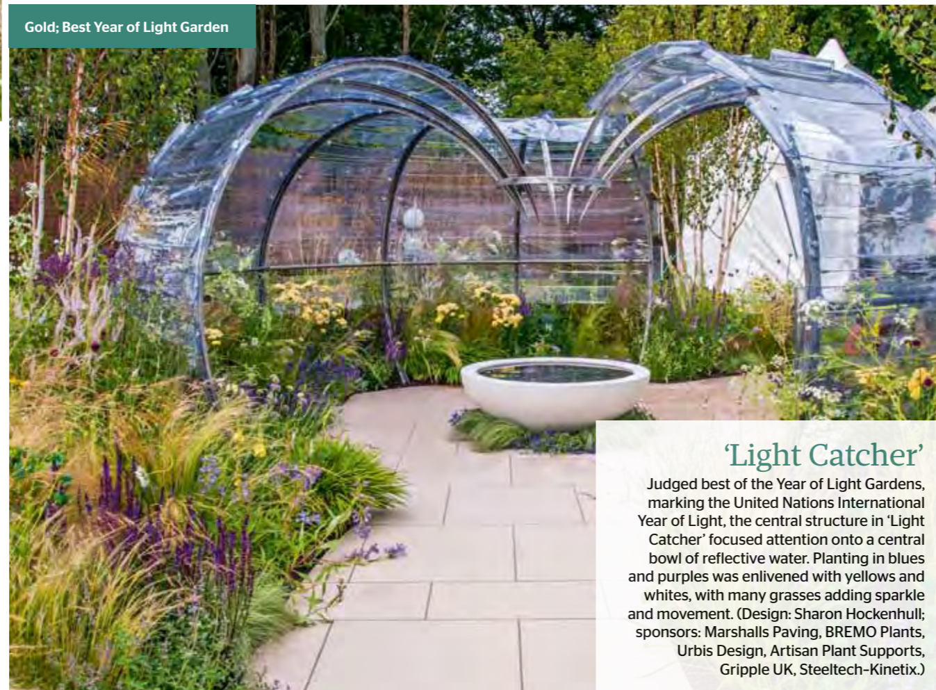
Gold; Best Year of Light Garden

Purple wooden poles enhanced with spirals of coloured wire added an extra, vertical element to a planting in the 'Cheshire's Carnival of Gardens' show feature.