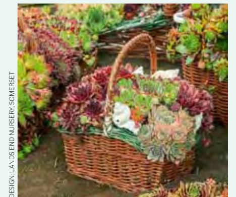
DESIGN: LANDS END NURSERY, SOMERSET

A group of wicker baskets made unusual, but strikingly original, containers for Sempervivum (houseleeks), more familiar in alpine troughs and on green roofs.