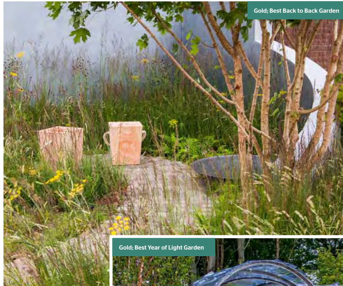
Gold; Best Back to Back Garden

This understated yet supremely elegant design by Sarah Jarman and Anna Murphy took Gold and the award for Best Back to Back Garden. Within the allocated 6 x 4m (20 x 13ft) space, a shimmering silver, curved wall embraced a secluded seating area with a shallow steel water bowl. The planting was similarly demure, featuring primarily an airy, naturalistic mix of grasses and ferns, and an exceptional multi-stemmed native field maple ( Acer campestre ).