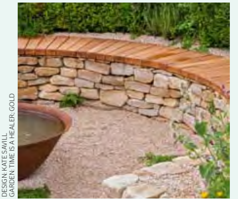
DESIGN: KATE'S AVILL GARDEN: TIME IS A HEALER, GOLD

A sunken area gave extra space in this modern physic garden, edged with dry-stone walling topped with wooden seats - a lovely combination of natural materials.