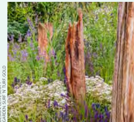
DESIGN: CLIVE SCOTT GARDEN: SURF 'N' TURF, GOLD

Verticals of a different nature helped evoke a maritime theme in a coastal garden without gravel: age-worn sentinels among salt-tolerant plants that typify the seaside.