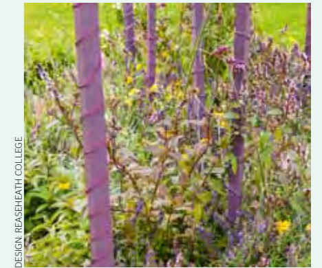
DESIGN: REASEHEATH COLLEGE

Furniture can transform a garden; here the curves and vivid red of the seat contrasted with the verticals of bamboo and Equisetum (horsetails) in a brave, flowerless design.