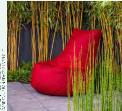
DESIGN: FRAZER MCDONOUGH GARDEN: URBAN SPACE SILVERGILT

Furniture can transform a garden; here the curves and vivid red of the seat contrasted with the verticals of bamboo and Equisetum (horsetails) in a brave, flowerless design.