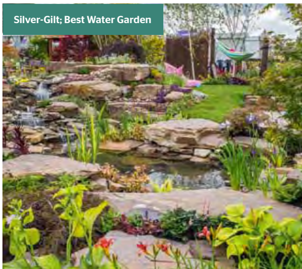
Silver-Gilt; Best Water Garden

A sunken area gave extra space in this modern physic garden, edged with dry-stone walling topped with wooden seats - a lovely combination of natural materials.