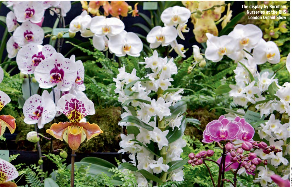
The display by Burnham Nurseries at the RHS London Orchid Show