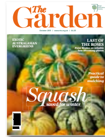
10 October 2011 pp1-98