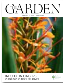
8 August 2011 pp505-580