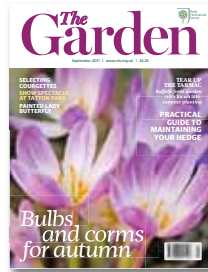
9 September 2011 pp1-106