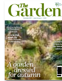
11 November 2011 pp1-106