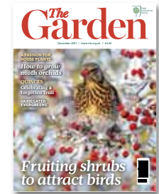
12 December 2011 pp1-90