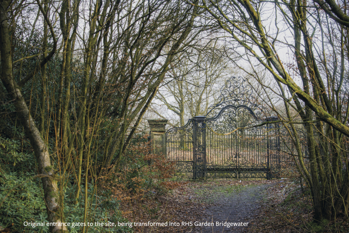
Original entrance gates to the site, being transformed into RHS Garden Bridgewater