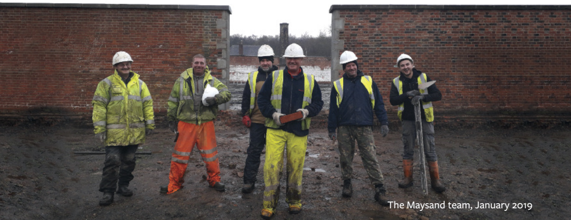
The Maysand team, January 2019

reusing 80,000 original bricks and repointing 40% of the overall wall face. The team will now spend several months wiring up the walls in preparation for fruit tree training, which will require a small matter of 5.7kms of wire, 5590 vine eyes and 570 tensioners!