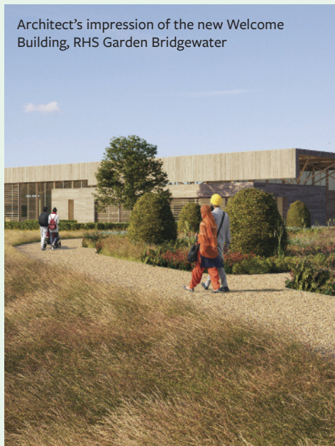
Architect's impression of the new Welcome Building, RHS Garden Bridgewater