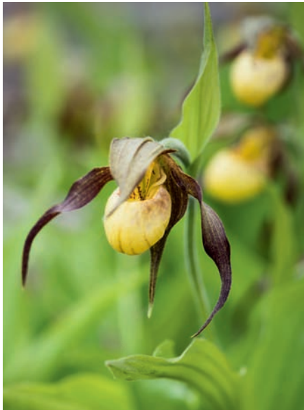
Cypripedium Hank Small gx.