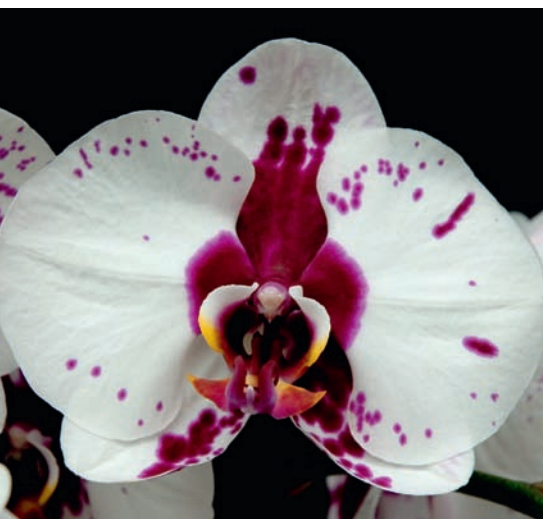
Phalaenopsis 'Picasso'.