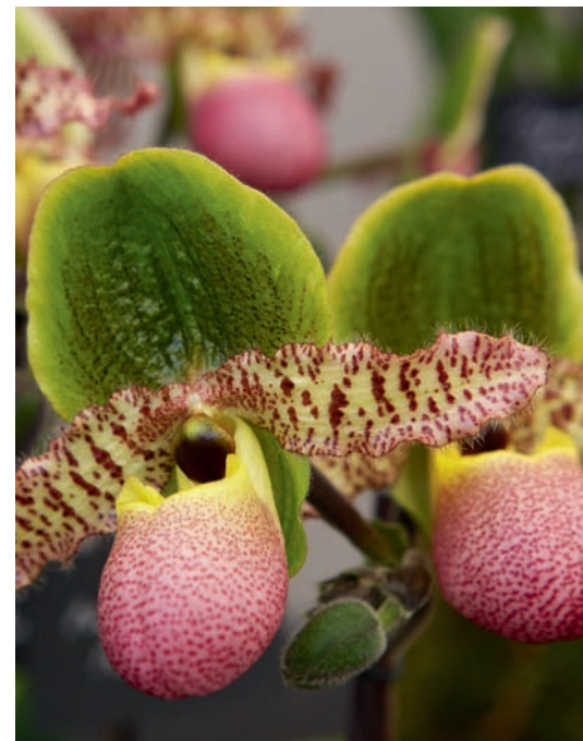
Paphiopedilum Pinocchio gx. Photo © RHS / Sarah Cuttle.

Larger-growing Cymbidium species. Clear green sepals and petals. Dramatic shape of the flower is quite unlike