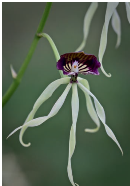
Prosthechea cochleata .

A large-flowered 'harlequin' Phalaenopsis (a form where no two flowers are identical). White flowers, with a burgundy centre and scattered burgundy spots. The burgundy-orange lip has a white-yellow edge on the side lobes.