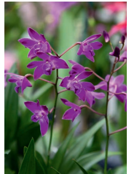
Dendrobium Berry gx.

To 30cm tall, with narrowly lance-shaped green leaves and solitary