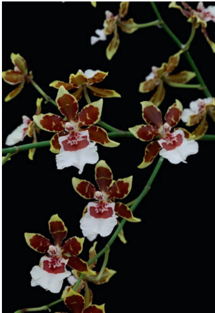
Oncidium Jungle Monarch gx.