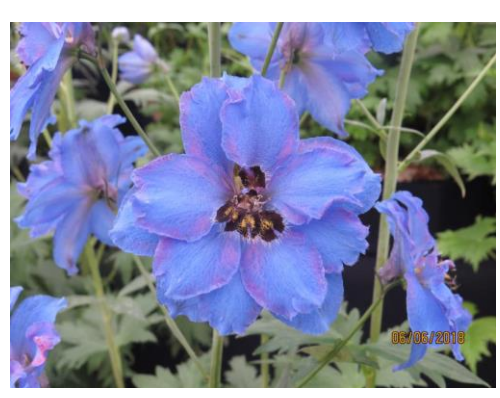
© G. Austin Home Farm Plants