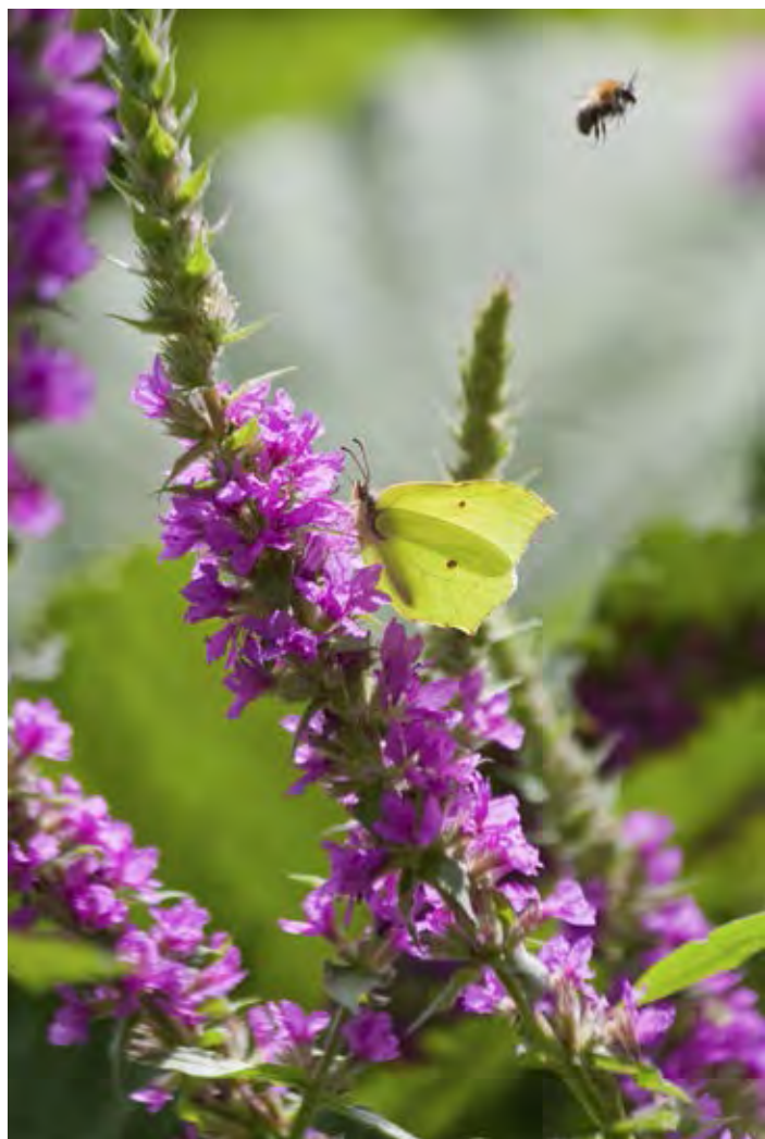
(brimstone butterfly on purple loosestrife, Lythrum salicaria ).